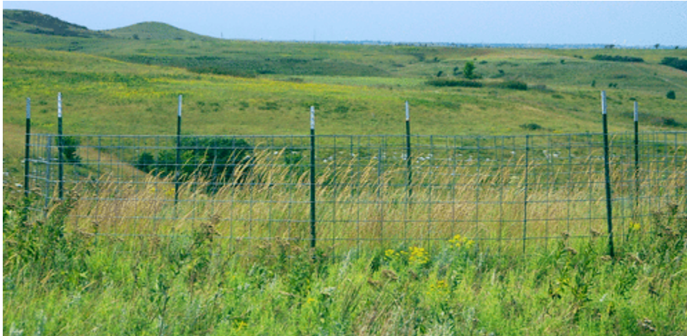
Plate 1. Exclosure located at Konza Praire, Kansas, USA, in annually burned grassland. The vegetation difference inside and outside the exclosure is evident with the tall dominant C 4 grass, Andropogon gerardii , flowering inside the exclosure and higher forb cover outside.

treatment (Appendix C: Fig. C3; van Oudtshoorn 2002). This plot-level turnover of species was also evident in the less common grass and forb species. Although both sites have an equal number of rare species (<25% frequency of occurrence, Fig. 2C, D), richness per plot was much lower at Kruger, and thus the spatial turnover of common and rare species was higher than at Konza.