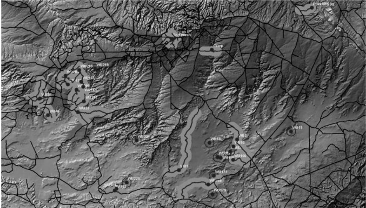
Figure 6. Spatial Proximity Analysis: A 100 yard circular “buffer zone” is created around each WU fossil locality (black dots). Only those fossil localities beyond 100 yards of any 4WD access route still have the circular “buffer zone” displayed; all the others are within the 100 yard “buffer zone”.