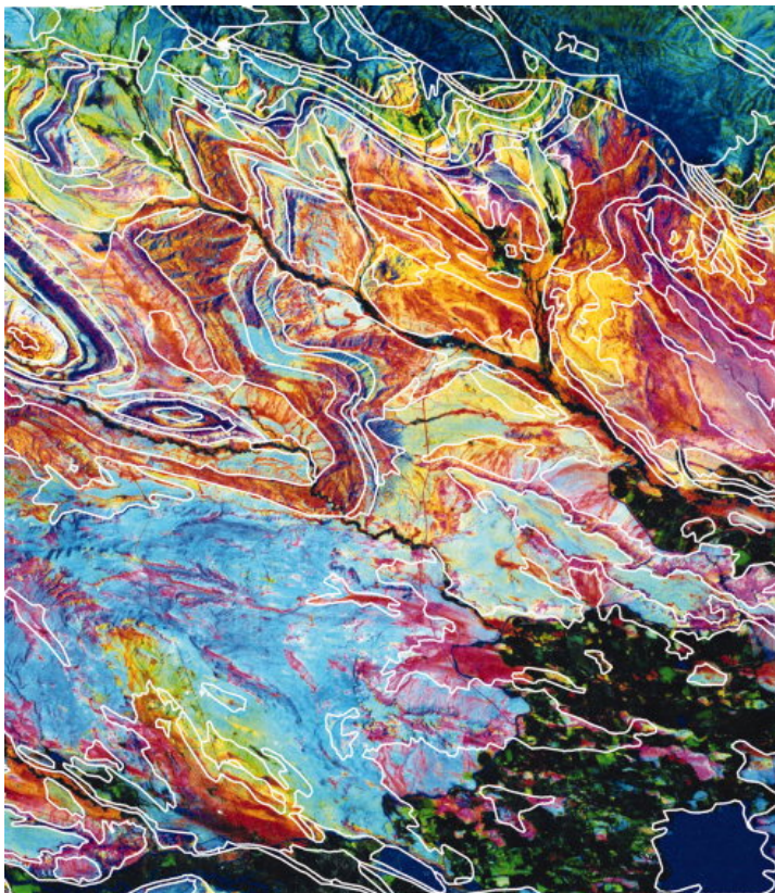
Figure 2. Principal components image of the northwestern part of the Wind River Basin, Wyoming. This image is a color composite of the 1st, 2nd, and 3rd principal components of all seven Landsat ETM+ bands displayed as red, blue and green, respectively.