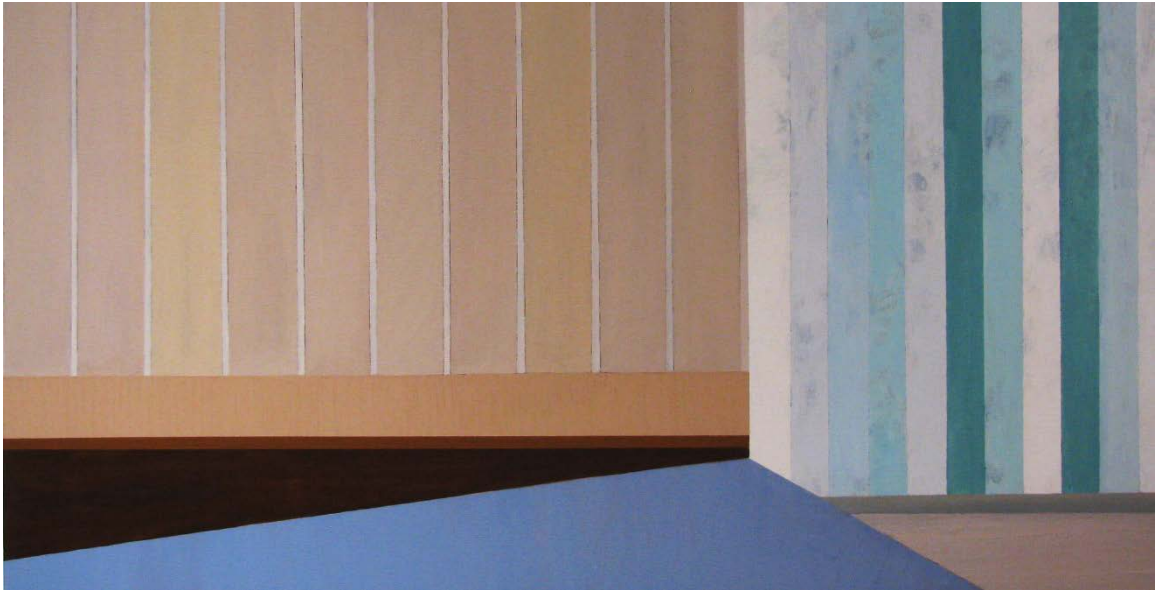
Figure 2. Resonant Spaces no. 1 (Kenner, 89-05), Oil on Canvas, 26"x44 1/4" , 2018