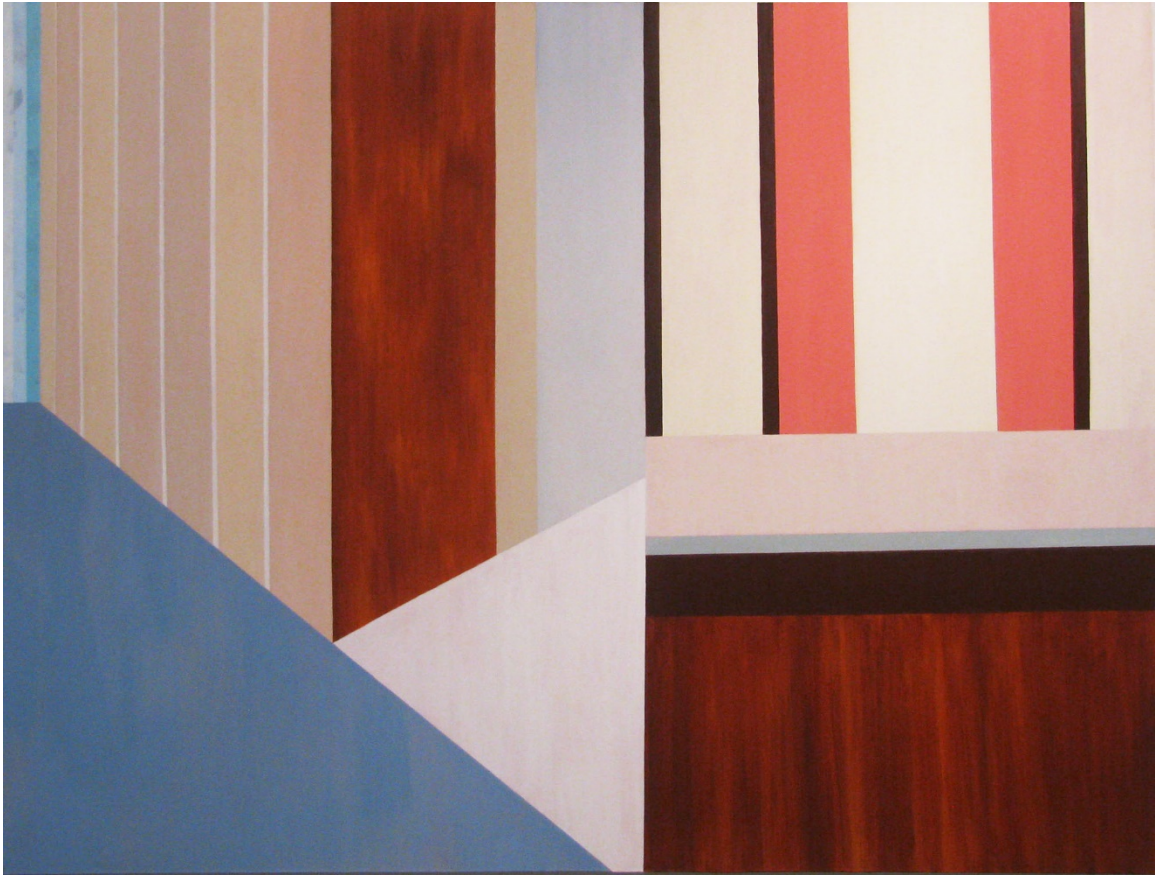
Figure 4. Resonant Spaces no. 5 (Kenner, 89-05), Oil on Canvas, 53"x70 1/4" , 2018