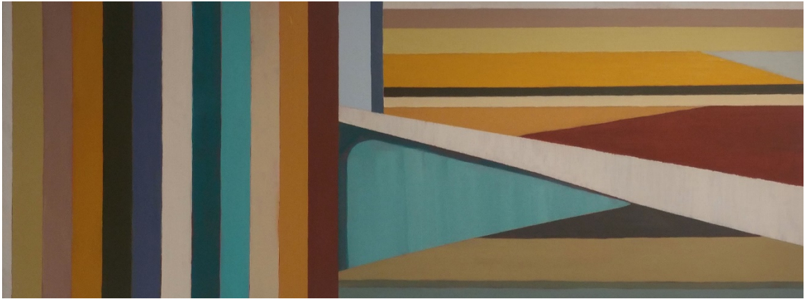
Figure 1. Ponchatoula, December , Oil on Panel, 16"x42" , 2018