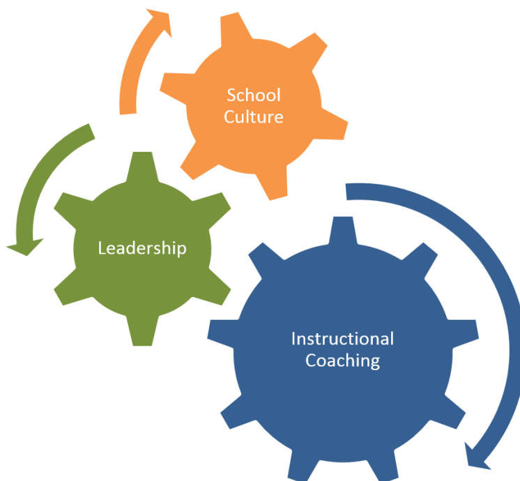
Figure 9. The Impact of Coaching Implementation.

coaching model (as described in the framework) in conjunction with strong leadership creates a synergistic cycle of continuous improvement that strengthens the school culture. Together, these components improve teacher practice and positively impact student achievement.