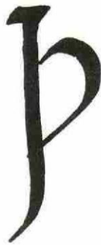
Figure 1 The Old English letter thorn

Interestingly, the sound of th was originally represented by one unique letter called thorn (see Figure 1). When William Caxton brought the first printing press to England from Holland in 1476 he had no thorn in his set of letters, and th replaced the single Anglo Saxon letter. In Scotland typesetters substituted the letter y for thorn (Venezky, 1999). This resulted in the curious spelling of the as ye , which we still see used in names such as "Ye Olde Shoppe" (Henderson, 1990).