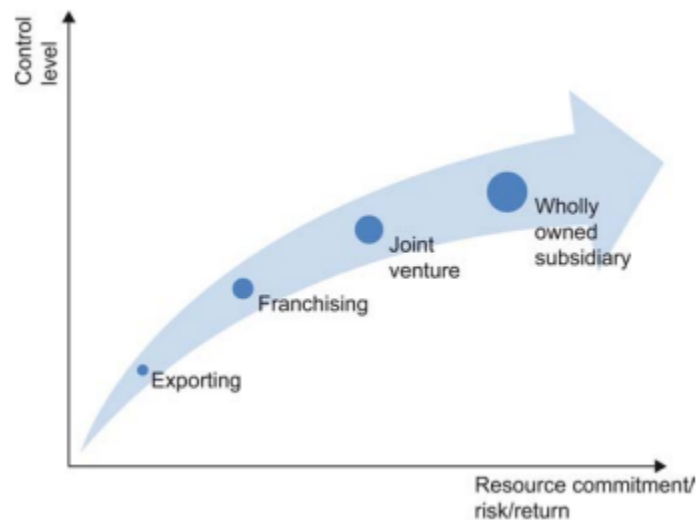
Figure 1. Entry modes characteristics

Whereas extant research has identified a number of factors relevant to the entry mode choice of fashion retailers, an integrated approach to entry mode choice for fashion retailers is lacking, which results in “an incomplete understanding of the factors” (Doherty, 2000, p. 227). In addition, Doherty (1999) argued that research on fashion retailers' entry mode choice remains under theorized. For example, theories such as transaction cost theory (Erramilli and Rao, 1993), resource based theory (Sharma and Erramilli, 2004), internationalization theory (Blomstermo et al., 2006), and bargaining power theory (Taylor et al., 2000) have been frequently used in explaining firms' entry mode choices in other industries, yet their potential application in the international fashion retail context has not been fully explored (Moore and Fernie, 2004). The present study incorporated the aforementioned theories to introduce a holistic and theory-based framework that systematically explains fashion retailers' entry mode choice.