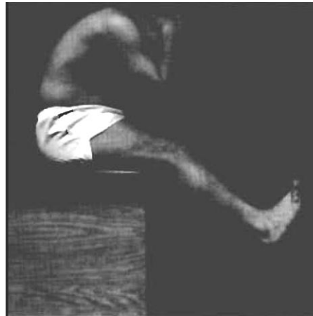
FIGURE 3. End position for the nonballistic active knee extension stretch in neural slump sit position.

With each active knee extension repetition maintained at end range approximately 1 second, the total time spent at end range in the neural slump sitting position would approximate the 30 seconds of the static stretch group. By attempting to equalize the time spent at end range for both stretch groups, we felt that the 30 active repetitions would emphasize the movement component of the active stretch group compared with the static stretch group. Additionally, by equalizing the total time spent at end range for both groups, any differences in ROM gains following treatment might be due to body positions and their effect on the different tissues that limit joint movement.