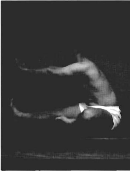
FIGURE 2. Static hamstring stretch.

subject then lowered the leg and relaxed the foot in plantar flexion. This stretch movement sequence was repeated rhythmically for a total of 30 repetitions. The sitting slump posture was maintained by overpressure throughout the total repetitions.