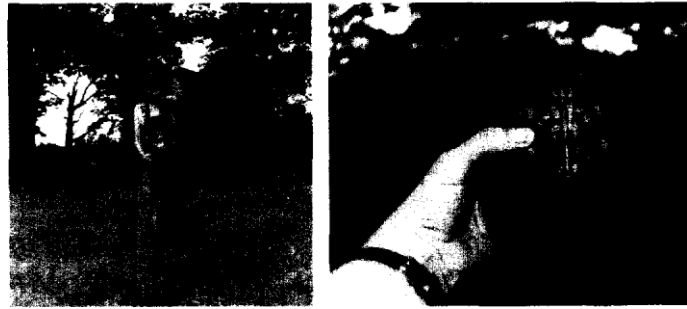
Students weigh, measure, and identify the gender of the turtles.

Initially, we tried to locate turtles by simply walking the school property on favorable weather days, but quickly realized that visual searches for box turtles conducted dur-