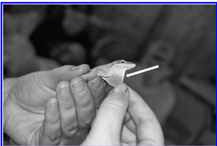
Figure 4. Male anole, Anolis carolinensis , found at Rockfish. Student shows the large, red dewlap (marked with arrow) that distinguishes male anoles from female anoles.