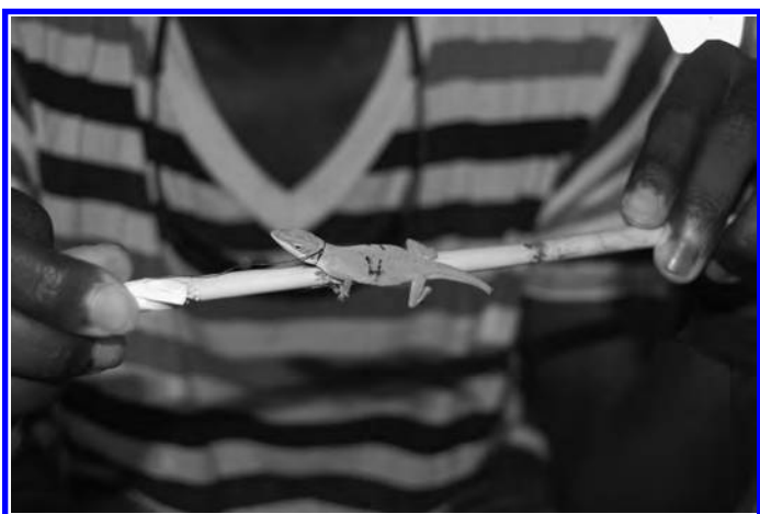
Figure 5. Marked female anole, Anolis carolinensis , with regenerating tail.