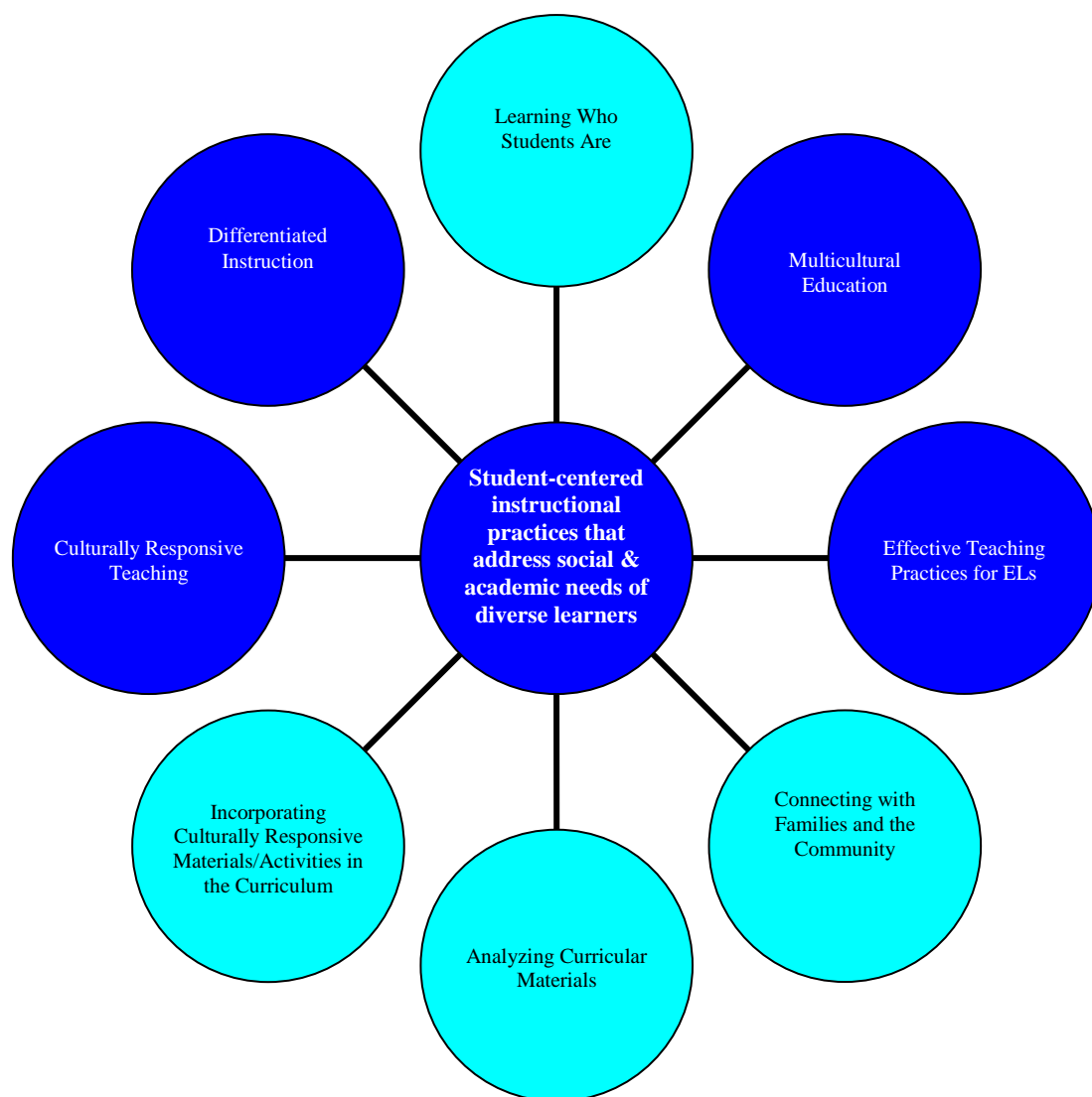
Figure 2. Culturally responsive instructional practices based on learnings from the data.