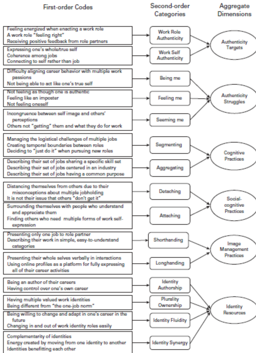
Figure 1. The relationship among first-order codes, second-order categories, and aggregate dimensions in data analysis.

When our subsequent interviews with the same informants suggested that the meaning and experience of authenticity was morphing over time, something that the prior literature could not explain, we reanalyzed all of our data and collected additional data to understand how and why these changes happened. This led us toward building a process-based model of authenticity. In our analysis of the data from the fifth and final round of data collection, we found that the data could be well categorized using codes from the first four rounds, indicating that we had reached theoretical saturation (Lincoln and Guba, 1985). At this point, we engaged in member checking (Marshall and Rossman, 2011) by sending summaries of our emerging findings to a subset of our informants to get feedback on how well our model depicted their experiences. 2