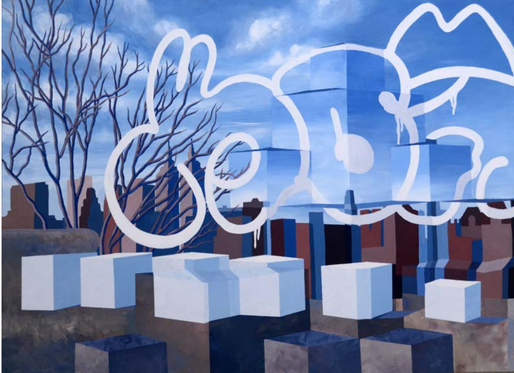
Figure 12. Laura Sellers. Projected New York City Cubed . Acrylic Painting, 2015. 66"x48."

In the paintings several different images are superimposed creating one psychic landscape with multiple perspectives creating a dynamic figure to ground relationship. The overlapping images include rural and urban landscapes, a group of variously arranged white cubes, and sketchbook drawings and diagrams. Some of the paintings combine brush strokes that show the artist's hand, and other areas are painted in flat even strokes that minimize the presence of the artist. The layering of different medias and perspectives offers a way to alter perspectives of perception. The viewer is seeing from two angles at once, as if they are moving through the landscape rapidly, characteristic of the way people move through land today. This movement keeps the eye from settling on any specific point in the paintings. The three different bodies of work all address the landscape, but with different results. This body of work considers the tradition of landscape with new medias a way to project the current state of urbanization.