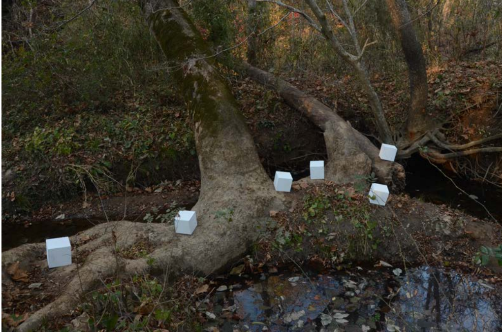
Figure 4. Laura Sellers. Untitled . Digital Photography. 2015. 13"x19."