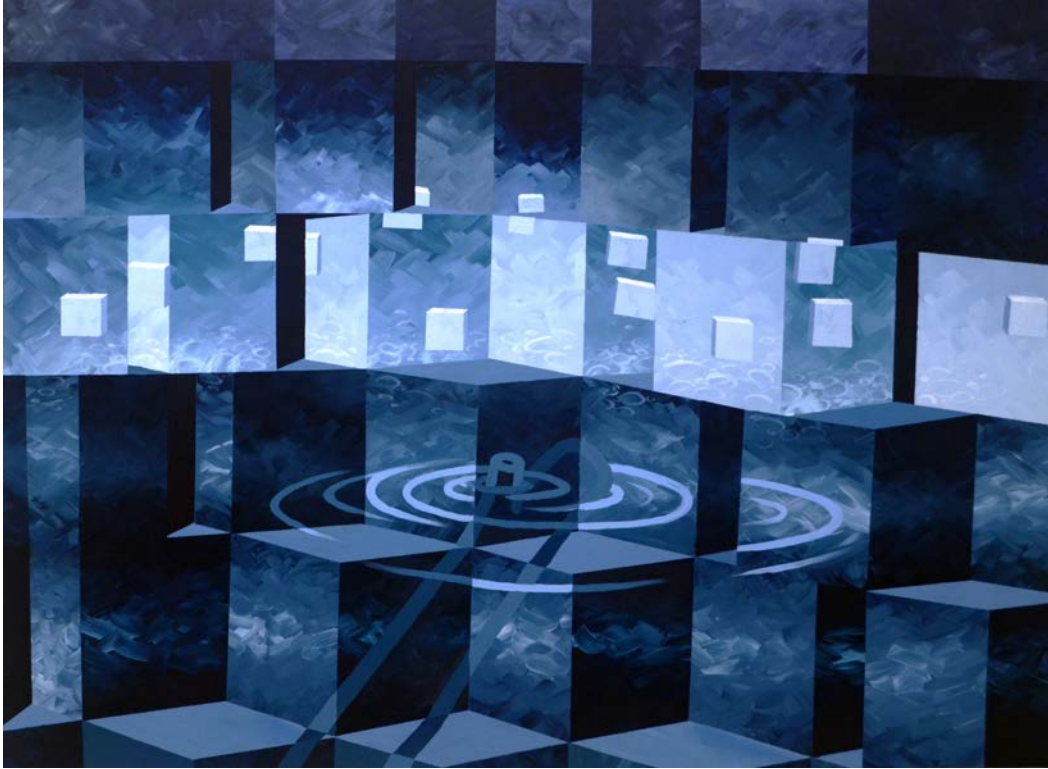
Figure 9. Laura Sellers. Projected River Cubed . Acrylic Painting. 2015. 66"x48."

The graffiti in the painting Projected Graffiti Cubed was actually sprayed on the garage door in the photograph from New York. In the other paintings, the graffiti was painted in from other photographs afterwards to unify and add another dimensional layer to the composition. The application in which it was painted shows the artist's hand in opposition to the rest of the strictly gridded composition. This last layer unifies the composition through looseness of application and line. It breaks the grid of the painting and was a major breakthrough in freeing the work. The graffiti also overwrites the realistic optical illusion that was painted, and in a way breaks or destroys the realistic aspect of the work.