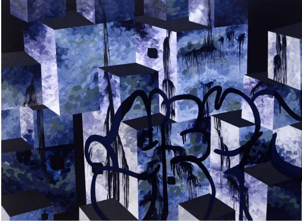
Figure 11. Laura Sellers. Projected Waterfall Cubed . Acrylic Painting. 2015. 66"x48."

The photograph used for the painting Projected New York Cubed was created using photos from a visit to New York City. The photo used for the painting was taken in Frederick Law Olmstead's manicured landscape, Central Park. Unlike the abandoned rural landscapes used in some of the paintings, the surrounding skyscrapers kept this landscape from the experience of the limitless horizon. Frederick Law Olmstead created Central Park, and it is an example of an ongoing relationship between man and nature. The continuous management of Central Park makes it a dialectical landscape where nature's natural processes are replaced by human maintenance (Smithson, Flam 160). The cube installations in Central Park carry with it the history of art and human intervention. This sensory experience of being in the new but inauthentic landscape is a newer version of a tradition connecting with contemporary audiences.