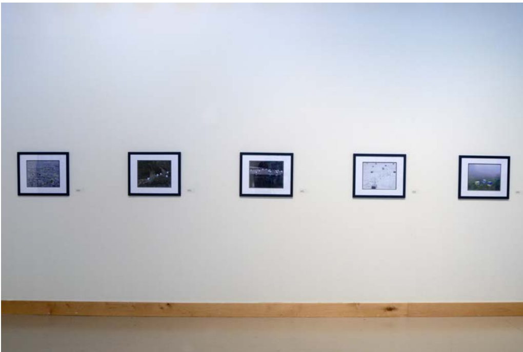
Figure 5. Laura Sellers. The Photographs (Installation View) . Digital Photography. 2015. 13"x19."