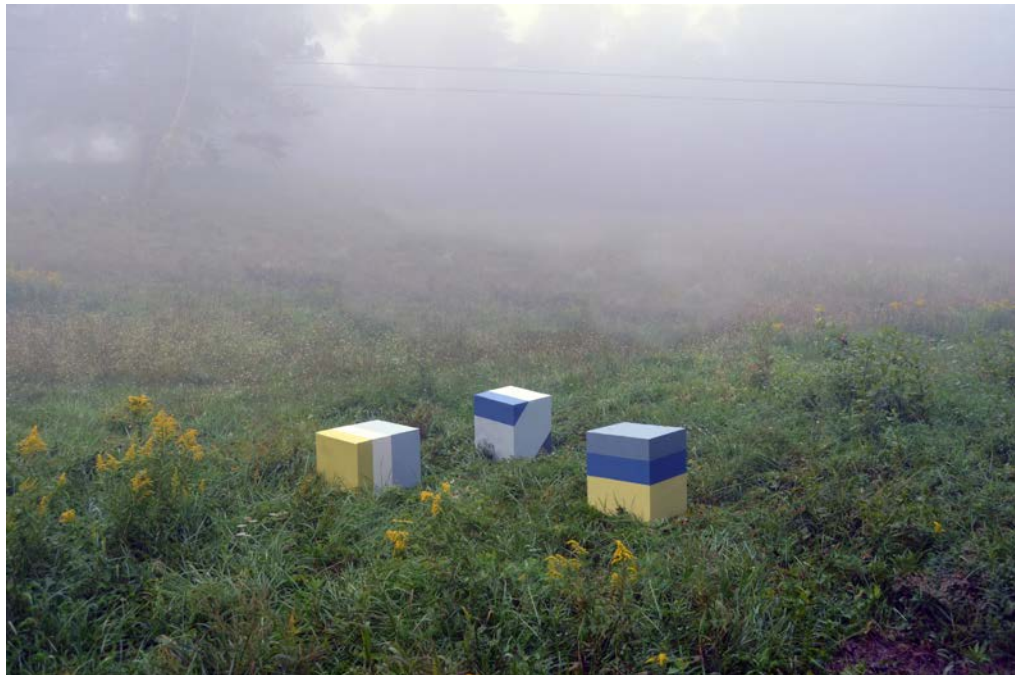
Figure 1. Laura Sellers. Untitled . Digital Photography. 2015. 13"x19."

In late November another shoot took place with a new set of boxes. The same desaturation palette restrictions were applied using red-orange and blue-violet that when combined make a neutral grey. The use of the desaturation scale causes extreme opposite colors on the color wheel to visually vibrate when placed next to each other. This palette was applied to the boxes in flat complementary colors, and it caused the color boxes to optically tremor or float in contrast to the natural environment. The colors connected the cubes with red-orange vibrancy of the leaves and cool blue-grey color of the mountains.