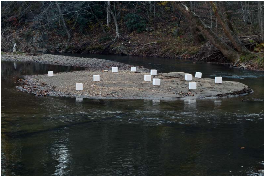
Figure 3. Laura Sellers. Untitled . Digital Photography. 2015. 13"x19."