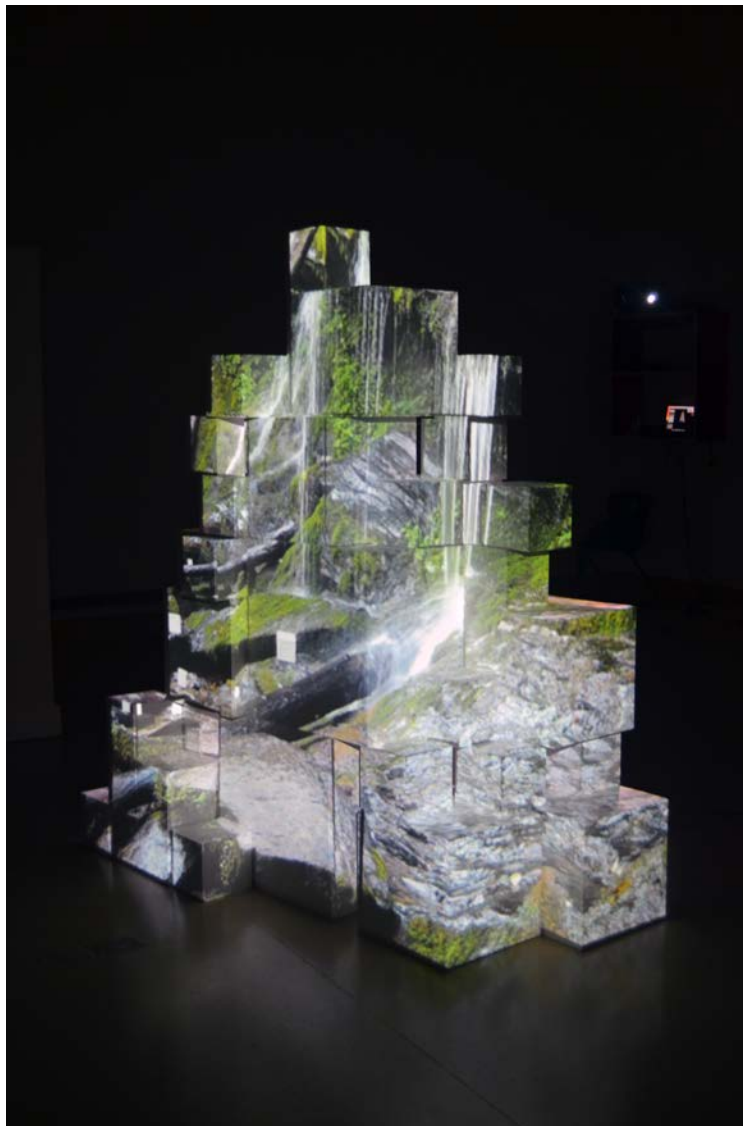
Figure 7. Laura Sellers. Inverted Waterfall Cubed (Viewed from the Back) . Projection Mapped Sculpture Installation. 2015. 77"x56."

this enters it in to conceptual space (Viola 173). Time is involved when experiencing the changing landscape through a car or plane window, and the projection installation loops the endless movement of a waterfall. Most people are removed from the landscape either experiencing it through the window or through viewing a landscape through cell phone screens or on television. The projection installation has a similar sense of digital removal from the reality of the waterfall.