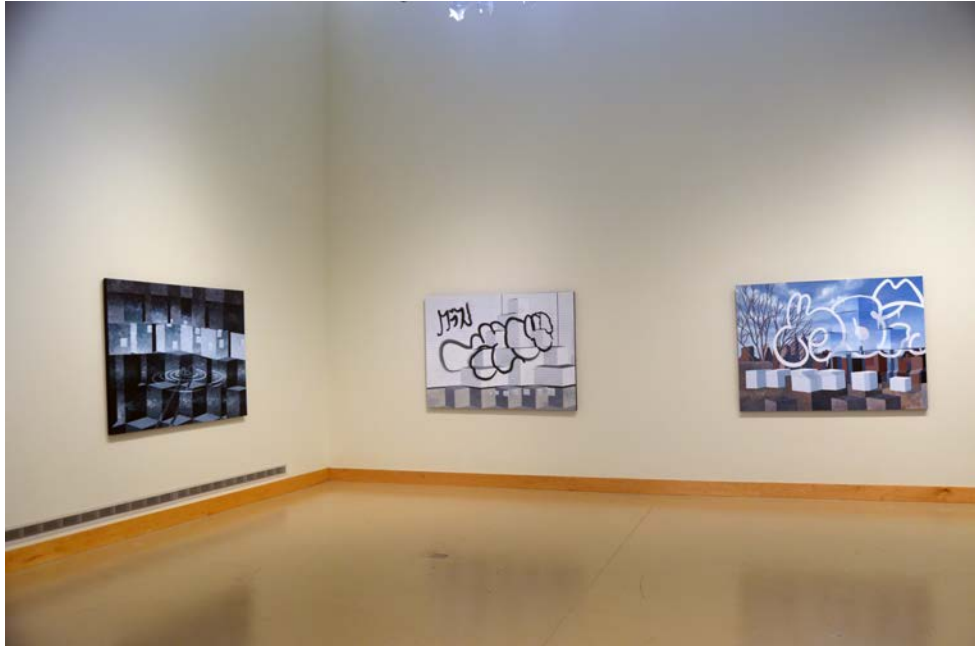
Figure 13. Laura Sellers. The Projected Paintings (Installation View) . Acrylic Paintings. 2015.