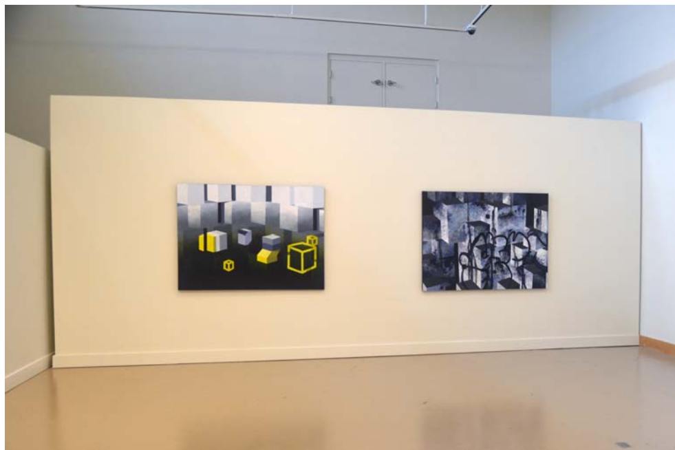
Figure 14. Laura Sellers. The Projected Paintings (Installation View) . Acrylic Paintings. 2015.