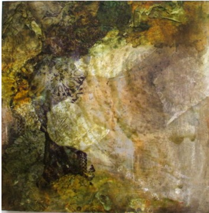
Fig. 2 Dawn Behling, Octoprint II: Algae , mixed-media on panel, 24 x 24 in., 2009

atmospheric environment that conveys depth which could include depth of the visual sense as well as watery depth of the octopus.