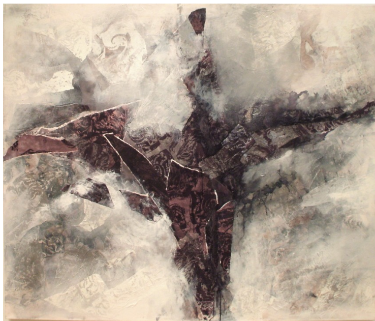
Octoprint IV: Ice and Air , Mixed-media on canvas, 60 x 50 in., 2009