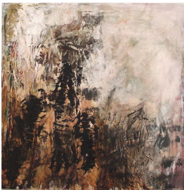
Wintery Texture , Mixed-media on canvas, 28 ½ x 28 ½ in., 2008