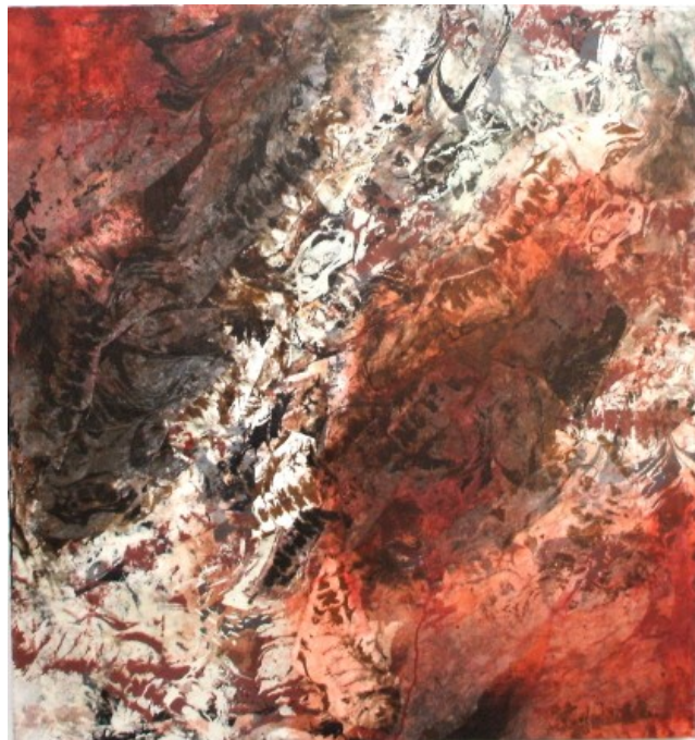
Fig. 4 Dawn Behling, Marbled Earth , Mixed-media on canvas, 34 ½ x 36 ½ in., 2009