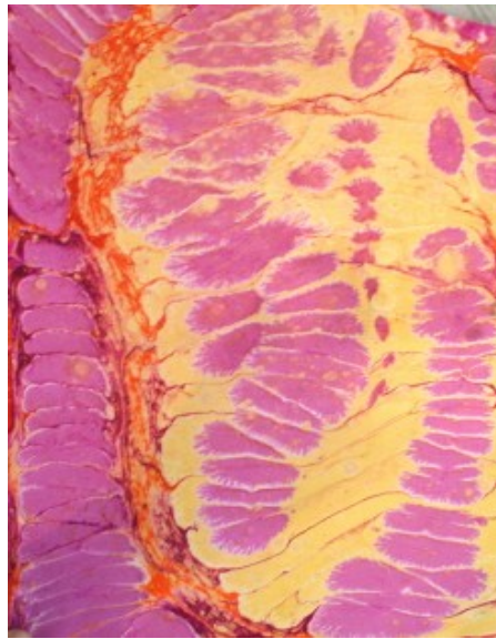
Fig. 3 Dawn Behling, example of marbling on fabric, 9 x 12 in., 2008