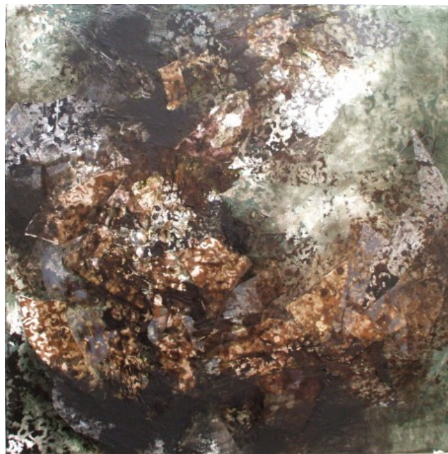
Space Flower , Mixed-media on canvas, 34 ½ x 34 ½ in., 2009