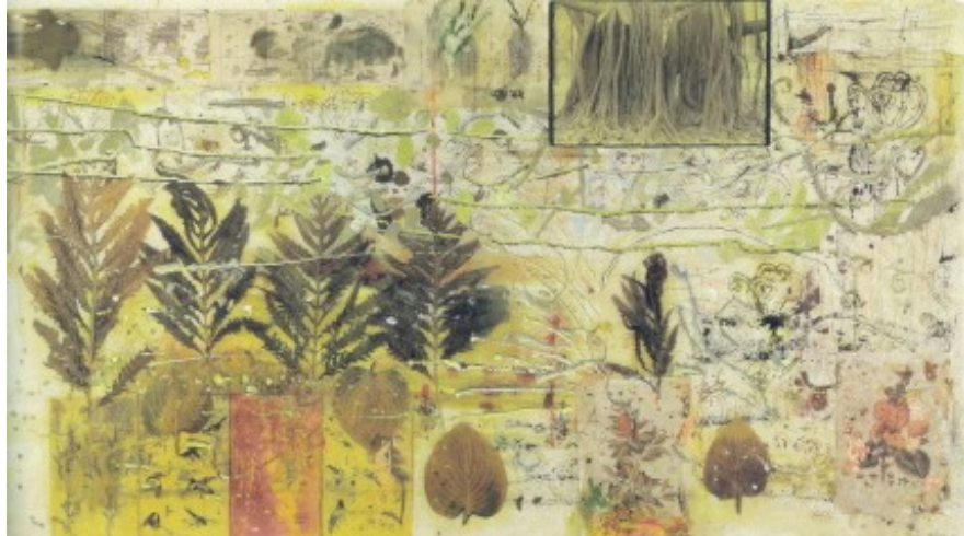
Fig. 6 Judy Pfaff, Untitled , Oilstick, encaustic, organic matter, photograph, approx. 48 x 80 in. (framed), 1998

sitting there, and all of the sudden it dawned on me that literally everything was moving...I was looking at these surfaces and they were covered with things that were alive.” (Whittaker 156-157).