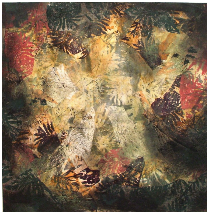
Palm , Mixed –media on canvas, 42 x 42 in., 2009