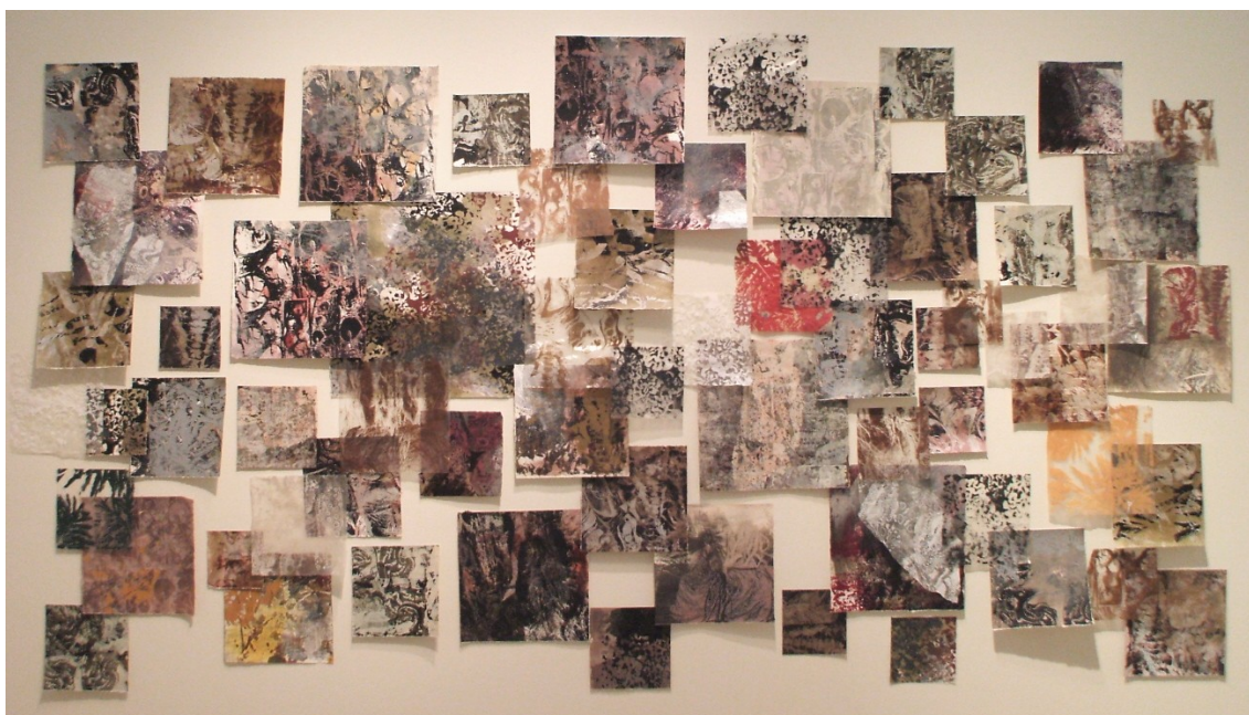
Large Elemental Landscape , Screen print and dye on various papers, 136 x 70 ½ in., 2008-2009