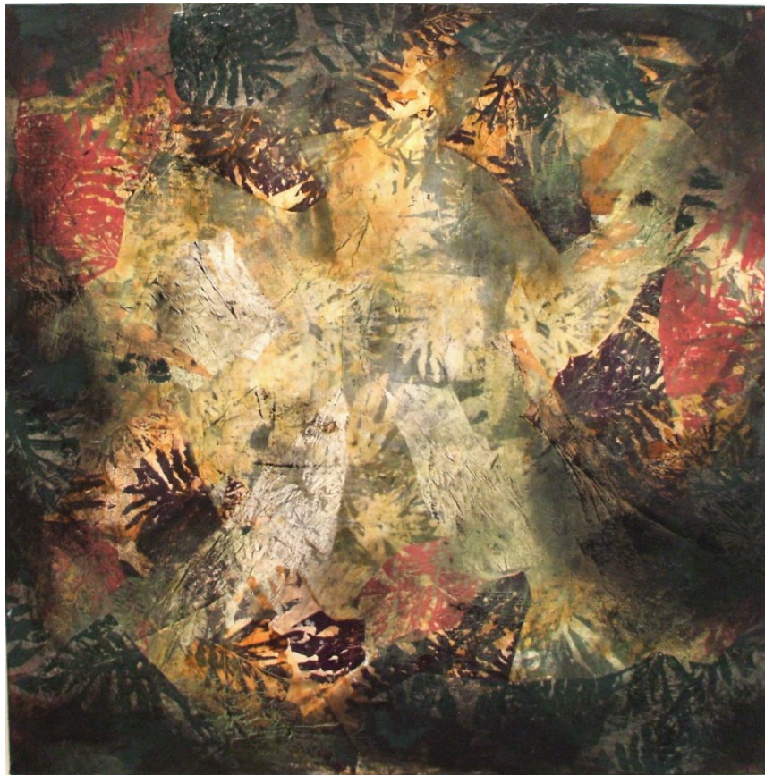
Fig. 5 Dawn Behling, Palm, Mixed-media on canvas

image and pattern itself. I feel that if the image and texture of the piece itself is what I want to spotlight in my work, then the square format accomplishes this goal more successfully.