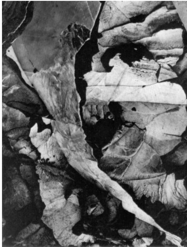
Fig. 10 Minor White, Moencopi Strata , Photograph, 1962

Minor White (1908-1976) was a noteworthy American photographer who took photos of the landscape from a unique perspective. He is known for his black and white “textural photography”.