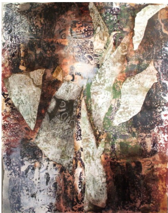
Octoprint I , Mixed-media on paper, 42 x 53 ½ in., 2009