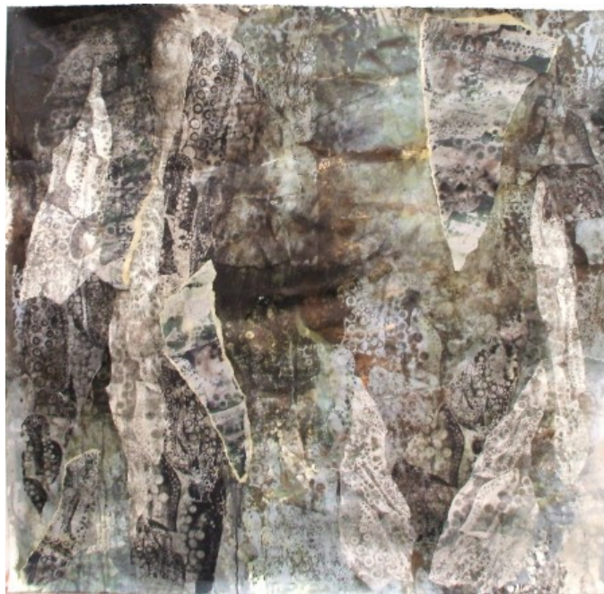
Octoprint III: Cave , Mixed-media on paper, 44 x 42 in., 2009