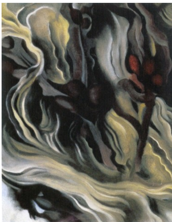
Fig. 1 Georgia O'Keeffe, Seaweed , Oil on canvas, 9 x 7 in., 1927

transparent paint and papers, I create an atmospheric composition that plays with the idea of the nature of space in a two-dimensional format which inspires a feeling that may or may not be directly related to the source imagery.