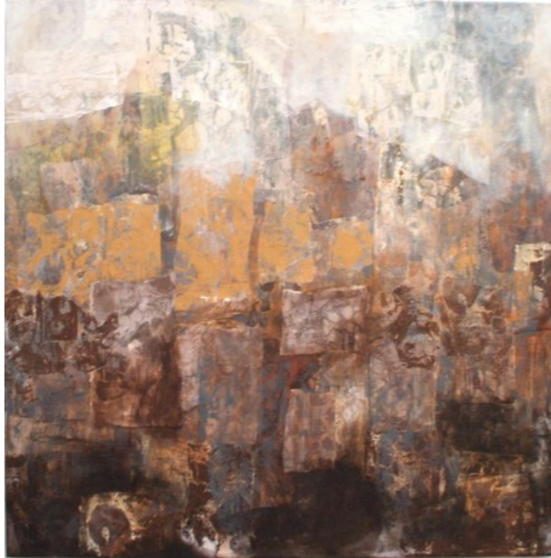
Tree Trunk Mountain , Mixed-media on canvas, 44 x 44 in., 2009