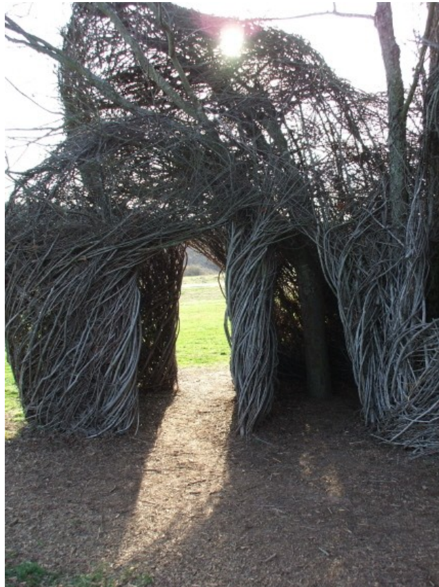
Fig. 8 Patrick Dougherty, Trailheads , 2005

Patrick Dougherty is an American artist known for his site-specific installations made out of twisted tree saplings. I admire Dougherty's work for the organic materials used. There is a feeling of controlled flow in his artwork. While his work is three dimensional, his materials and concepts are drawn from nature and relate to my work. The vines he uses in his sculptural compositions are representative of the nest forms that I am drawn to. I had the privilege of seeing two of Dougherty's sculptures, one at Penland School of Crafts, and the other at the North Carolina Museum of Art. The overall compositions of the sculptures were striking, but what actually drew me in were the textures of the material and their tactile quality when seen up close.