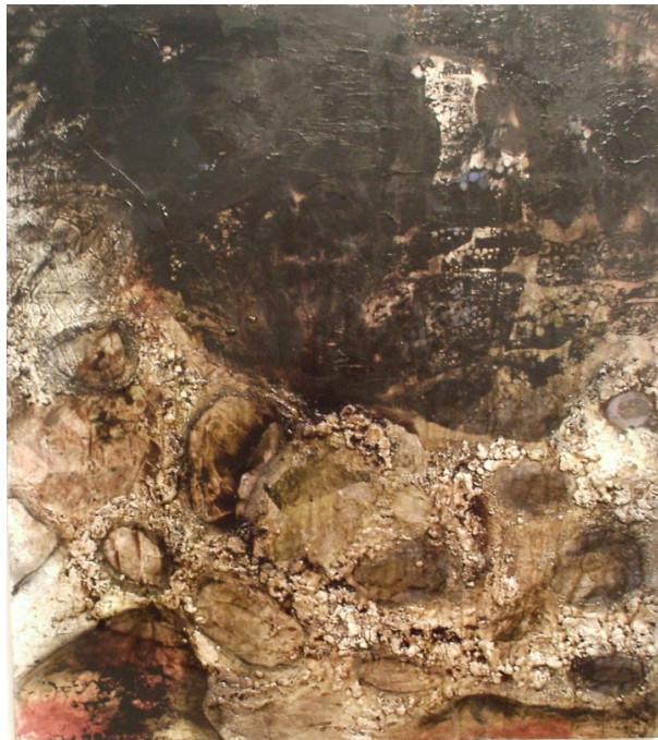
Transformation , Mixed-media on canvas, 44 x 50 ½ in., 2009