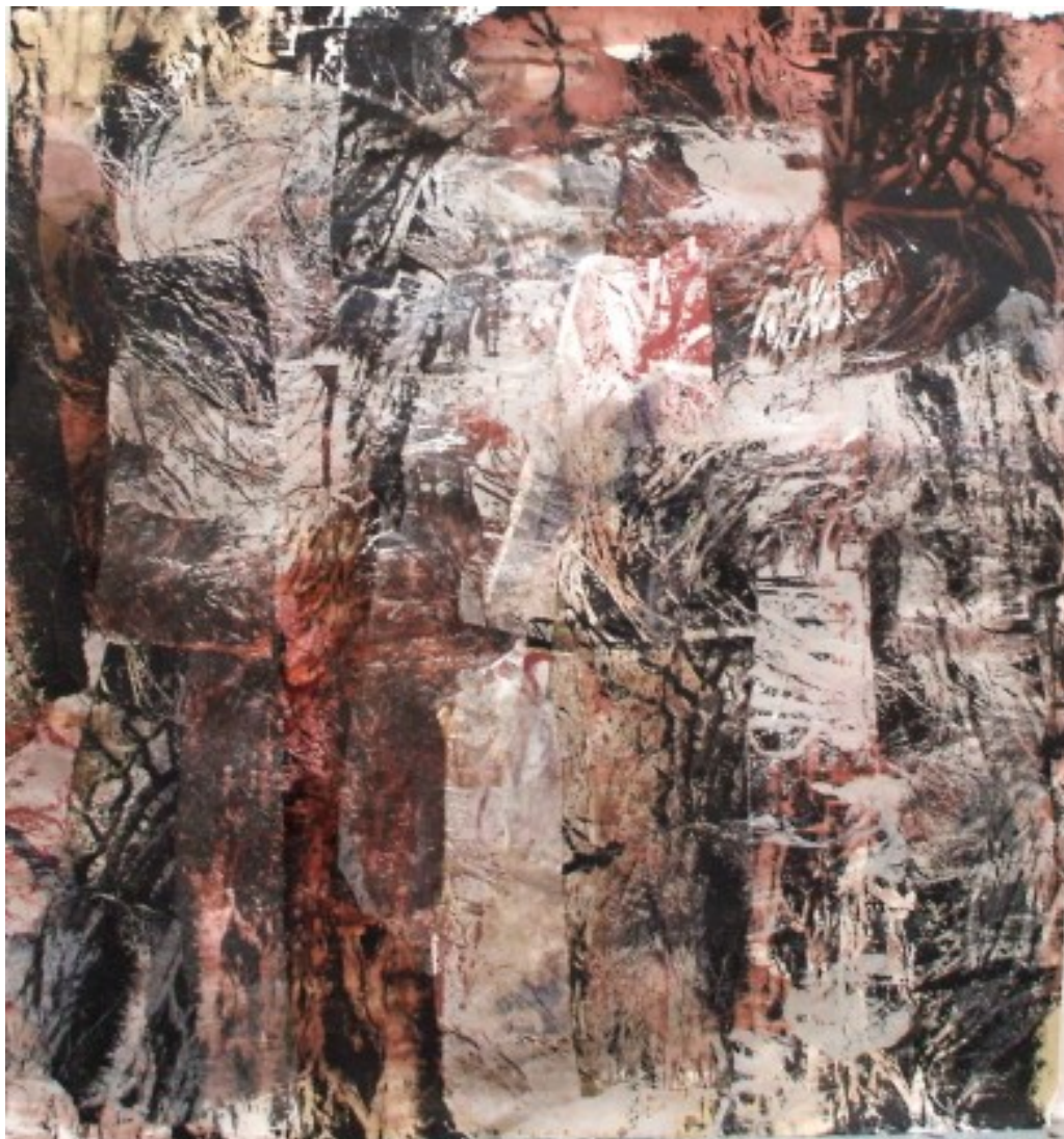
Fig. 9 Dawn Behling, Layered Branches , Mixed-media on paper, 28 ½ x 28 ½ in. 2009