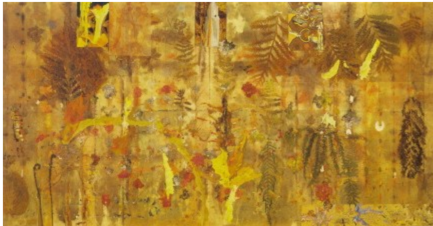
Fig. 7 Judy Pfaff, Charhar Bagh , Encaustic, ferns, burns, magazine pages, appliqués, ink, pencil, 53½ x 97½ in.(framed),1999