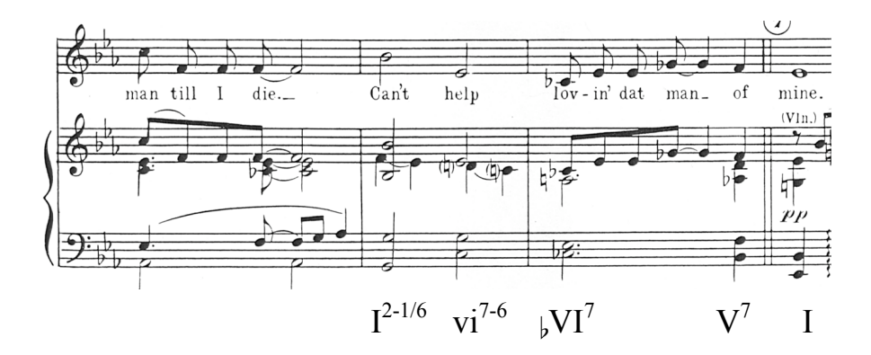
Figure 1. "Can't Help Lovin' 'dat Man" title phrase. 54

Kern used an ingenious v-shaped melodic line that descends with angular perfect intervals that ascends by an arpeggiated major triad to g-flat, before it resolves by step to the tonic e-flat. This melodic shape portrays an ambivalent quality to the text. The love is inevitable, but does it make her happy? The c-flat on "lovin" is the "blue" note, as well as the lowest pitch of the melody, but it feels higher because of its intervallic relationship to the initial pitch as a major seventh. This placement (and the enharmonic spelling) presents a challenge for the singer to approach it vocally. The harmonic progression of the phrase reinforces the quality of strangeness (perhaps Otherness?) with its delayed resolutions. I find it curious that Kern subverts the status quo of a standard cadential pattern by inserting a chromatic (yet distant) major triad on the text, "lovin" 'dat man." It provides another ambiguous quality for subversive characterization from a gender context, yet the song as a whole perpetuates the hegemonic standard of woman's role in relationship to "her man."