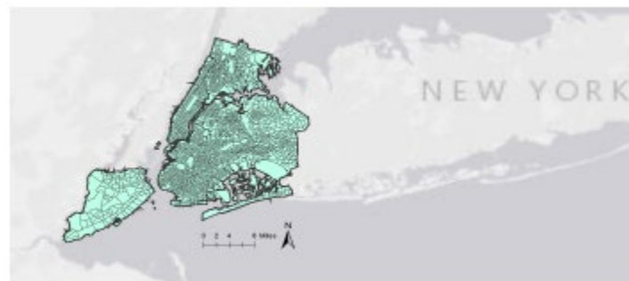
Figure 1: Study area: New York City census tracts

With the promising results achieved in these studies, it is evident that these modeling efforts enhance traditional approaches. However, more research is needed to fully grasp the potential of social media in predicting mobility patterns at small spatial scales using new techniques and integrating traditional and new datasets. The application of artificial neural networks (ANNs) in travel demand modelling was introduced in 1960. However, despite their success at learning and recognizing patterns, they were not used for about three decades due to their slow response to the inputs' modifications [24]. ANNs have shown great advantages in prediction, pattern identification, optimization, and signal processing due to their non-linear and flexible structure that can solve complex problems [6]. While ANNs have been used in different transportation studies [i.e. 21], their applications in understanding and modeling mobility patterns within cities need further investigation.