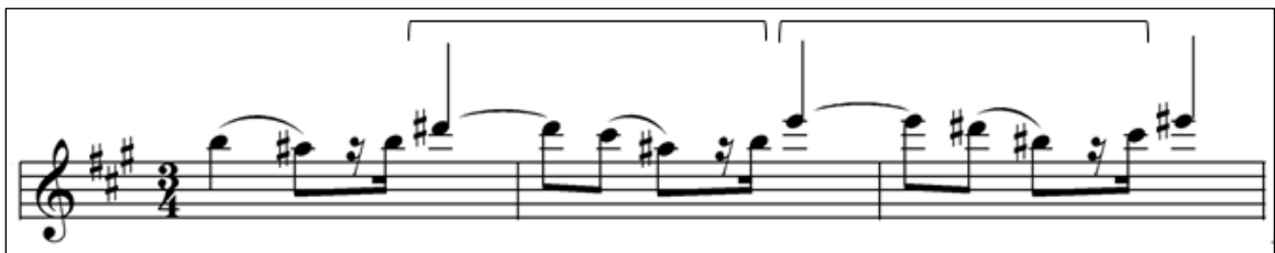
Figure 9. Triumph Motive in the A-major Piano Quartet, I: Piano Upper Line, mm. 57-59.

This figure recalls militaristic dotted rhythms and projects an underlying sense of vigor and authority underneath the wafting, imitating strings in mm. 57-59.