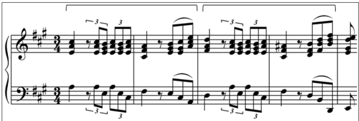
Figure 7. Piano Quartet No. 2 in A major, Op. 26, I: Piano Part, mm. 1–5.

To set the stage for this interpretation, I return to MacDonald’s profile of the work. He goes further in his description of the piece, claiming that its opening idea, with its rhythmically distinct halves, achieves “a statuesque balance of force.” 101 Figure 7 shows the opening idea as it appears in the piano part.