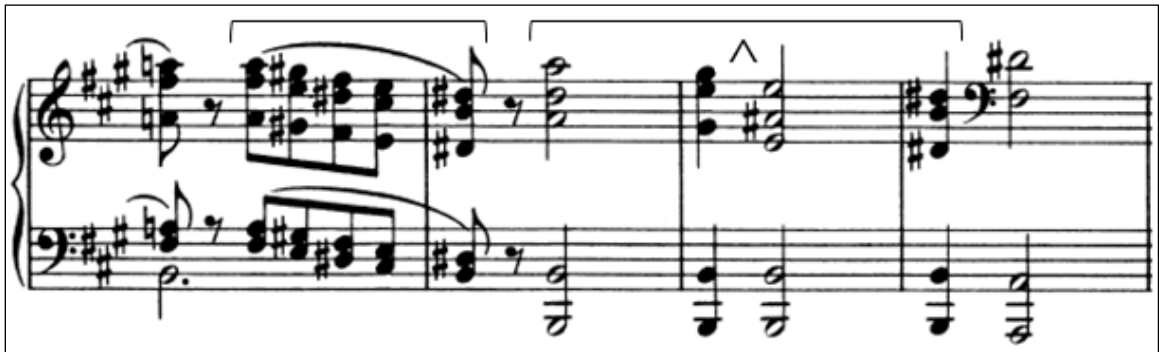
Figure 8. First Instance of Linkage in the A-major Piano Quartet, I: Piano Part, mm. 44-47.

Above the expanded motive in mm. 45-47, the strings become more legato and lyrical immediately after their second escape attempt beginning in m. 43. The strings' C \sharp in m. 45 not only represents the local climax, but also the highest registral point for the strings thus far. Contrasting with m. 41, the end of the first