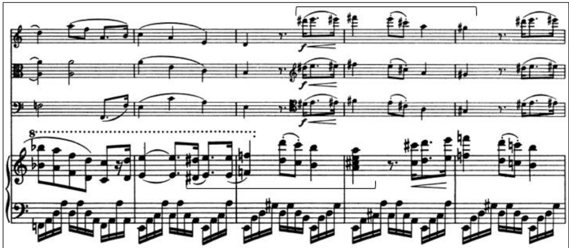
Figure 11. Third Instance of Linkage in the A-major Piano Quartet, I, mm. 198-202.

The passage spanning m. 193 to the downbeat of m. 209 constitutes one phrase that divides into two overlapping segments. The overlap takes place in mm. 200-201, where a tonic cadence occurs in the piano above a dominant pedal. In mm. 199-200, the piano's upper line contains the rhythmic figure that links the