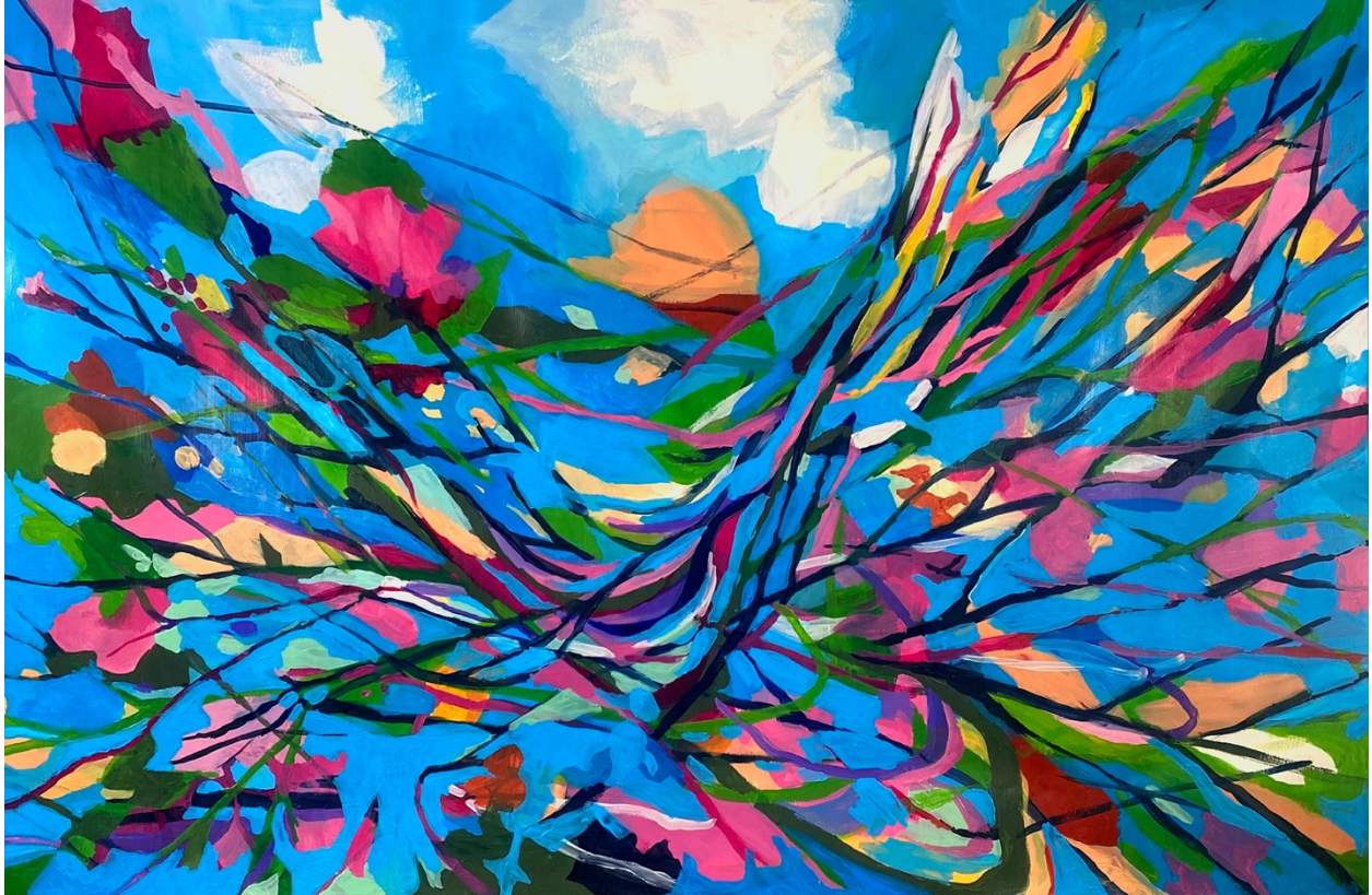
Figure 5. Detail photo of Live for the Day , 31 x 46 inches, Acrylic on paper, 2022