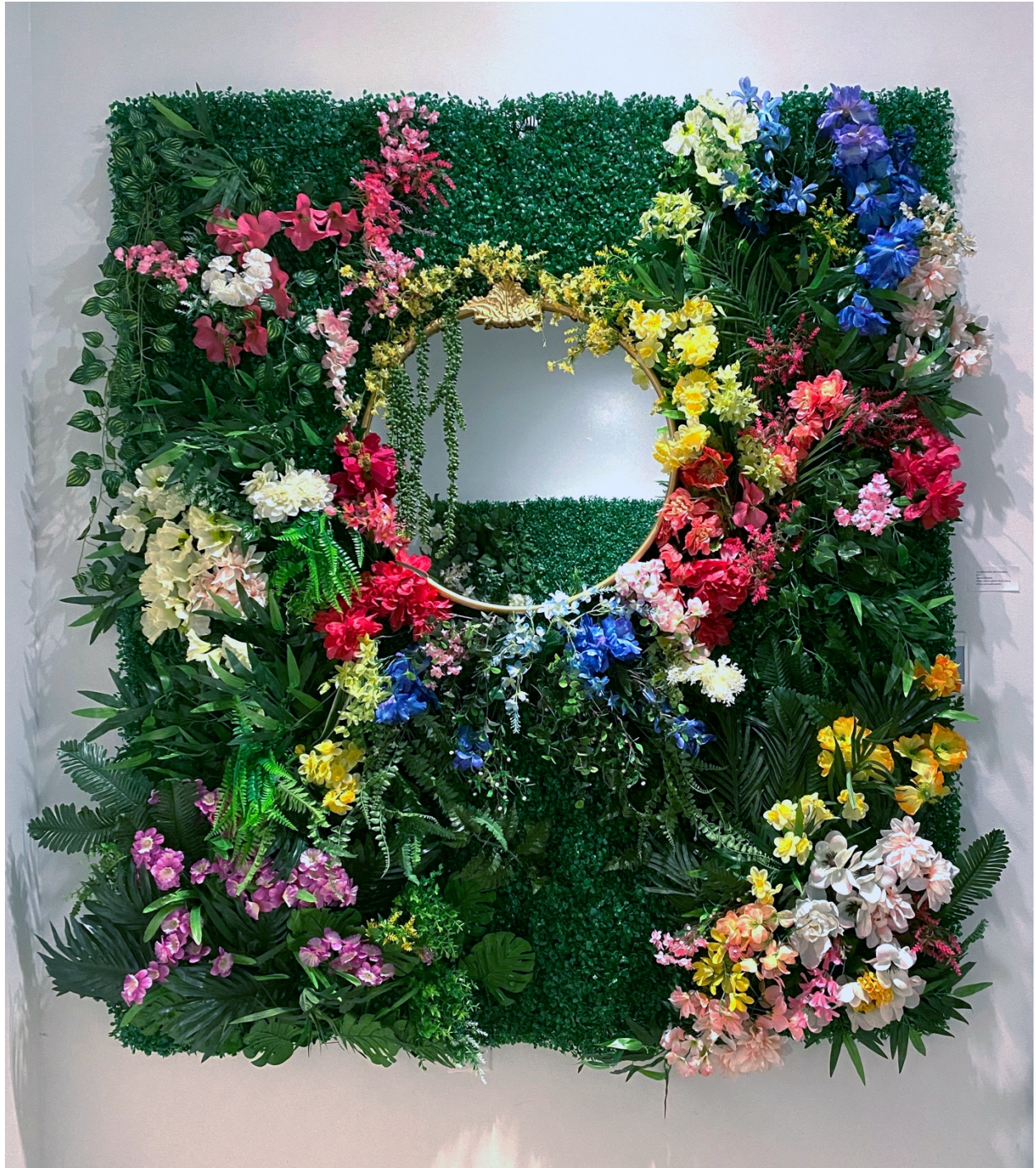
Figure 11. Install photo of the right panel of You Will Be With Me in Paradise , 6 x 5 feet, Plastic plants, plastic floral stems, mirror, and audio poem, 2022