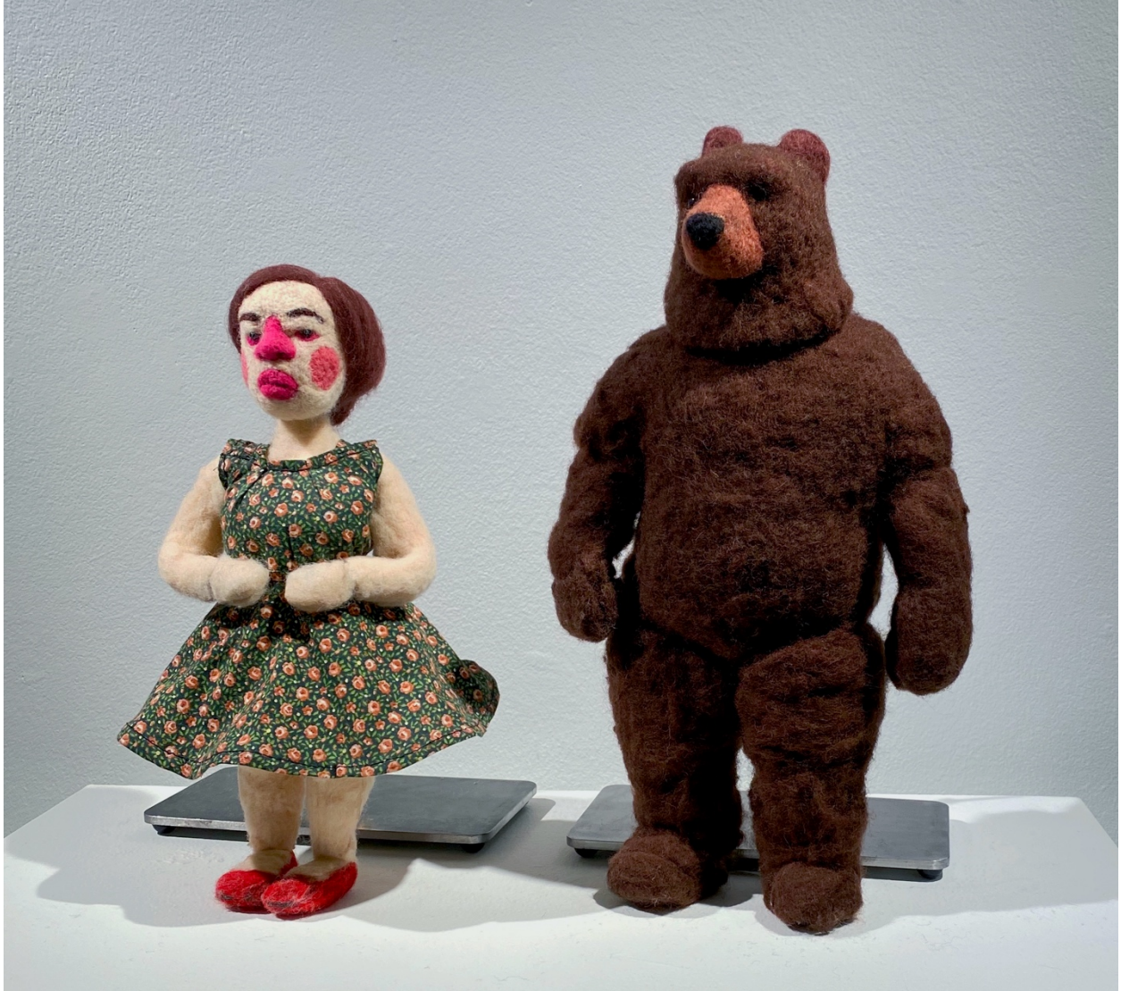
Figure 6. Install photo of The Goon and The Bear puppets , 12.5 x 7.5 inches and 14.5 x 8 inches, Needle felted wool, fabric, brass and steel armatures and rigging, 2022