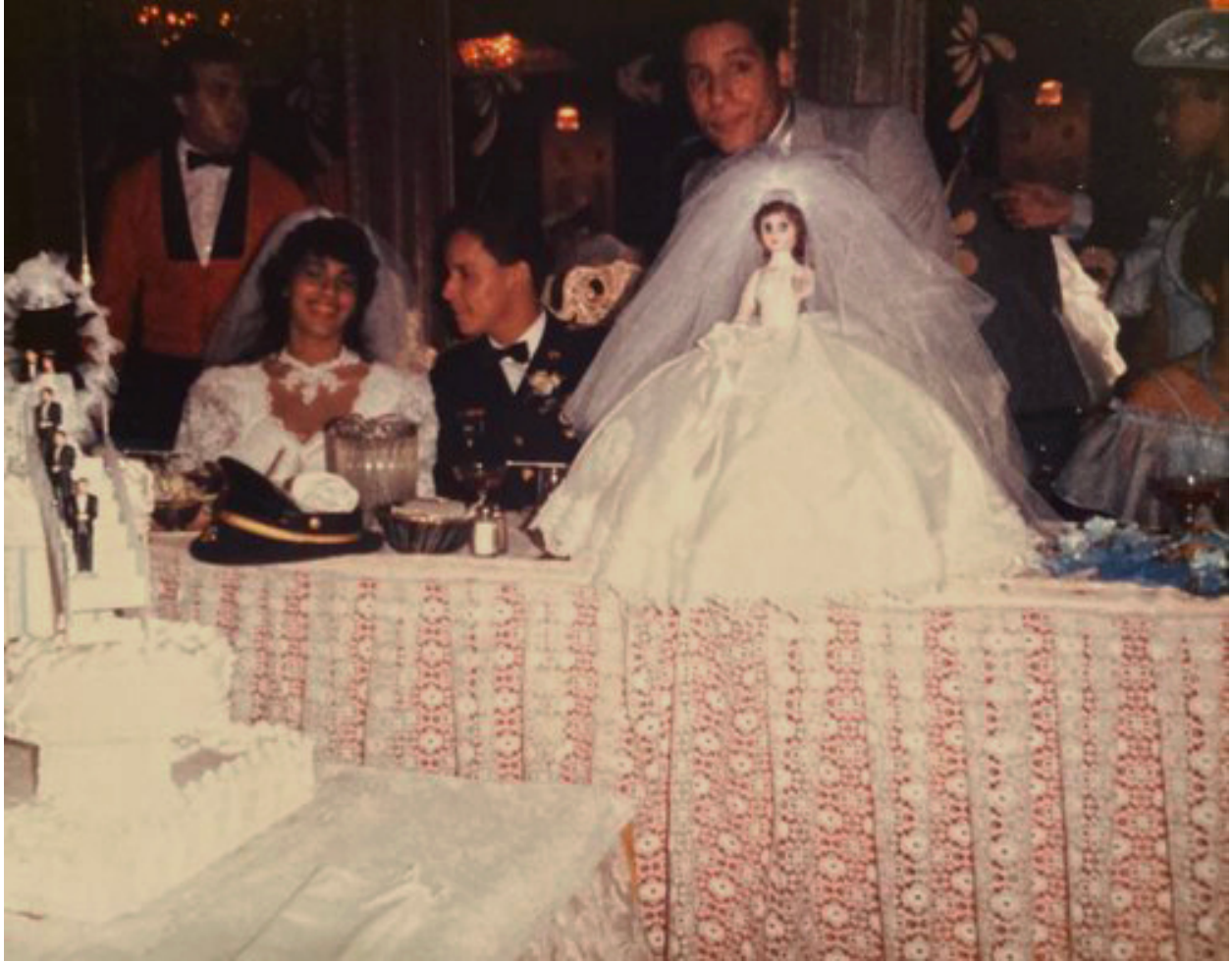
Figure 4. Detail photo of a Puerto Rican Bridal doll, From the artist's personal collection of family photographs and photographer is likely the artist's mother, c. 1970