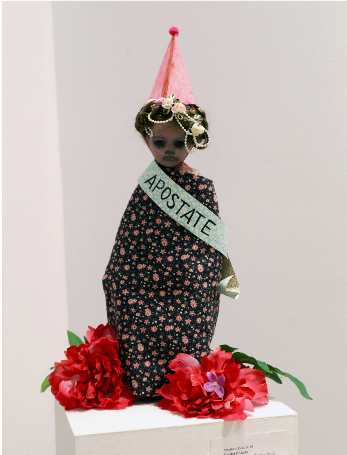
Figure 3. Install photo of Apostate Doll , 20 x 18 inches, Porcelain doll, fabric, paper, pom-pom, fake flowers, ink, and paint, 2019