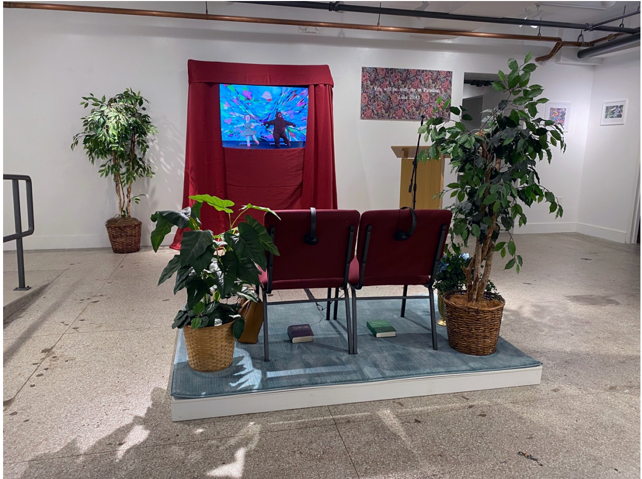
Figure 7. Install photo of I'd Like to Teach , size variable, Stop motion animation, audio song from the “Katie’s Kingdom Songs” audio cassette, wood, fabric, paint, podium, microphone, microphone stand, curtains, faux plants, books, chairs, and carpet, 2022