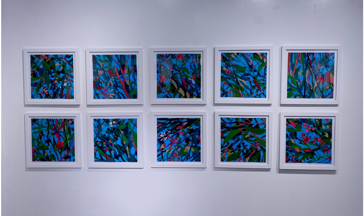
Figure 1. Install photo of Can You See Nos. 1-10 , 12 x 12 inches each, Acrylic and fabric on paper, 2022