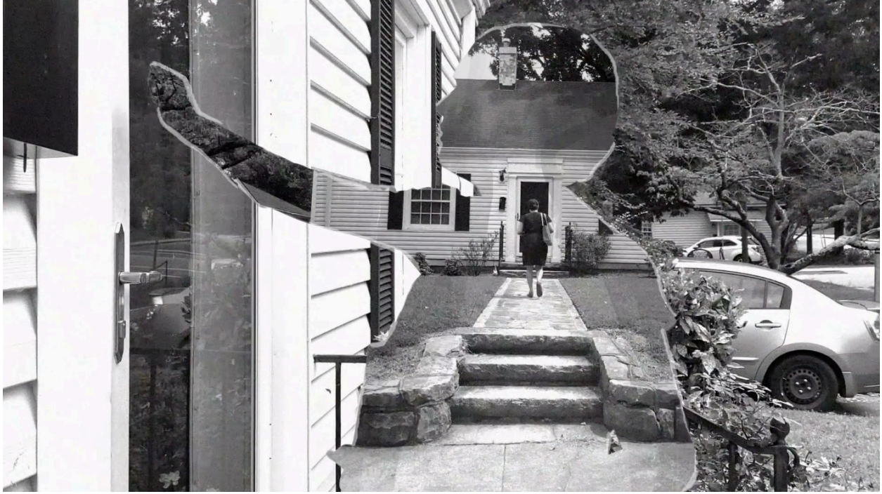
Figure 9. Detail still image of Field Service , size variable, Rotoscoped animation on a tv screen, 2022