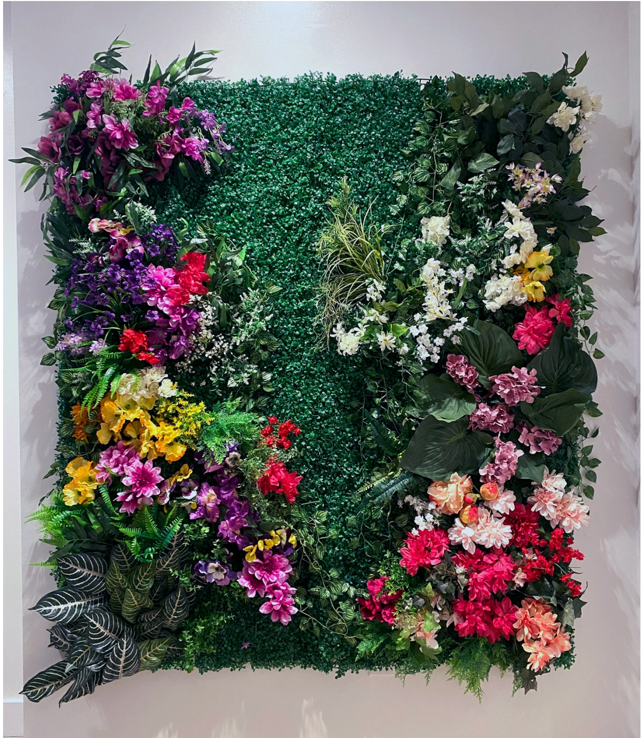
Figure 10. Install photo of the left panel of You Will Be With Me in Paradise , 6 x 5 feet, Plastic plants, plastic floral stems, mirror, and audio poem, 2022