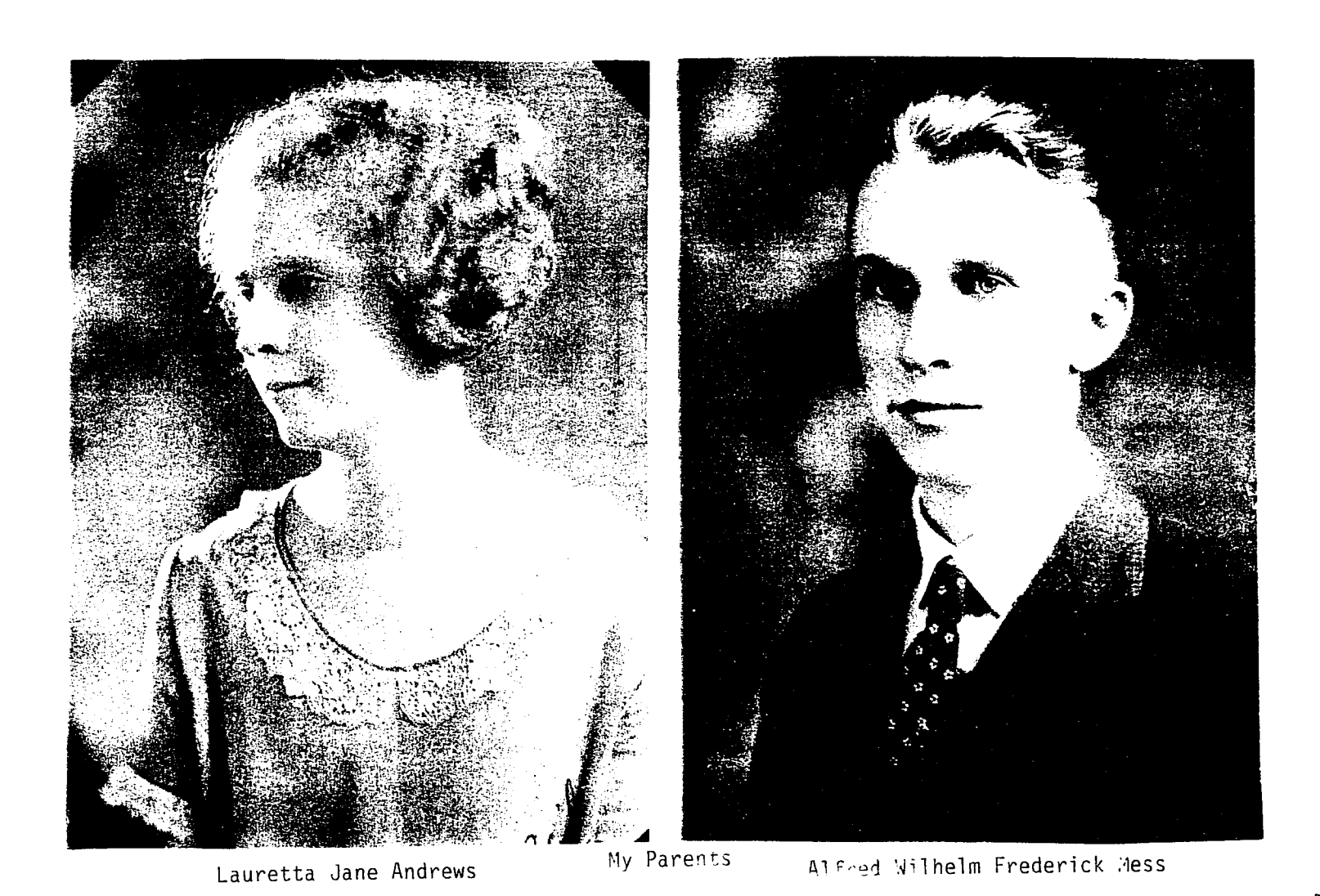
Wedding Day: August 15, 1925