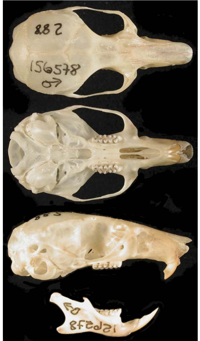
Fig. 2. —Dorsal, ventral, and lateral views of skull and lateral view of mandible of an adult male Peromyscus boylii boylii (Museum of Vertebrate Zoology [MVZ] 156578) from Hopland Field Station, Mendocino County, California (30°00'N, 123°05'W). Greatest length of skull is 27.3 mm.

The following morphological measurements (mean and range; mm) are from 10 adult topotypes of P. b. boylii (sexes not distinguished) from the Middle Fork of the American River, Eldorado County, California: total length, 197 (183–202); length of tail vertebrae, 103 (92–112); length of hind foot, 22 (21–23); and length of ear from notch (dry), 16.4 (15.3–17.5—Osgood 1909). The following means and ranges (mm) are from 11 specimens of P. b. rowleyi collected in Aguascalientes, Mexico: total length, 194.3 (175–210); length of tail, 103.6 (89–115); length of hind foot, 20.1 (12–22); length of ear, 19.0 (18–21); greatest length of skull, 26.5 (25.8–27.0); length of rostrum, 10.9 (10.6–11.5); length of nasal, 9.5 (9.0–10.0); width of zygomatic, 12.9 (12.6–13.5); maximum width of braincase, 12.3 (11.9–12.7); width of mastoid, 11.4 (11.1–11.8); minimum interorbital width, 4.3