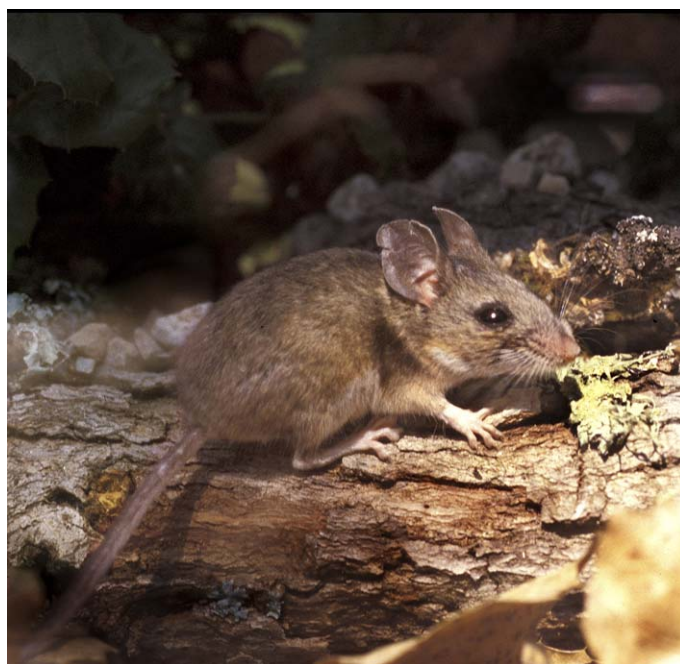
Fig. 1. —An adult male Peromyscus boylii rowleyi from lower Robertson Creek at the Hastings Natural History Reserve, Monterey County, California (22.5 km southeast of Carmel Valley, 36°22’N, 121°22’W). Photograph by Matina C. Kalcounis-Rueppell, 27 July 2002.

CONTEXT AND CONTENT. Order Rodentia, suborder Myomorpha, superfamily Muroidea, family Cricetidae, subfamily Neotominae, tribe Reithrodontomyini, subgenus Peromyscus ; boylii species group (Musser and Carleton 2005). The genus Peromyscus includes 56 nominal species (Musser