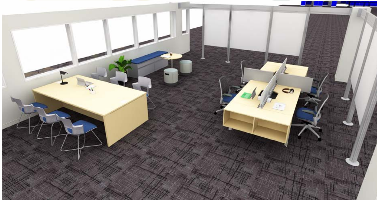
Towson University Library Data Studio