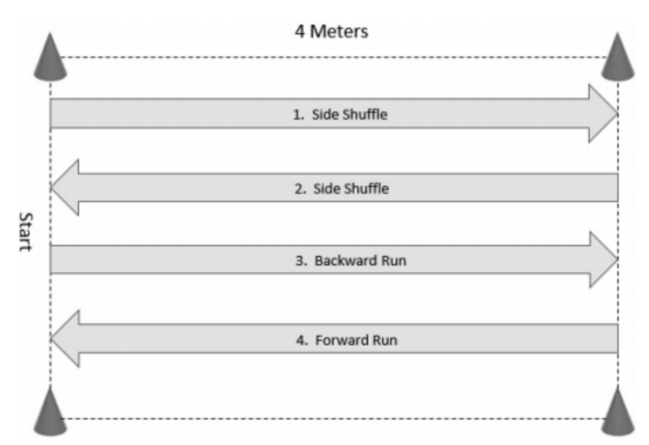
Figure 1. YYIR1-GK diagram of movement for 1 bout. Distance between cones is 4 m in each direction. Direction of movement (right or left) for the first side shuffle was self-selected by the goalkeeper and kept consistent.