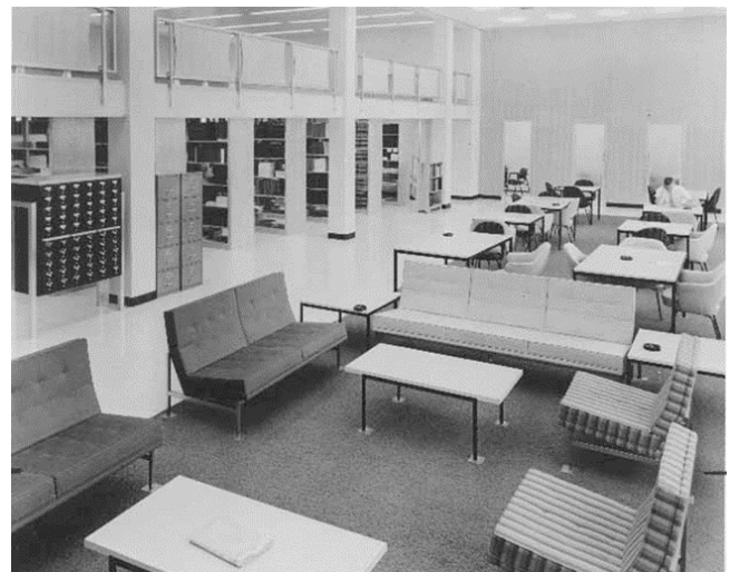
Figure 2: Chemstrand Library at the University of North Carolina at Charlotte, 1970

veloping business interests and academic expansion. The increase of special libraries in the state directly correlated with the escalating importance of tobacco, textiles, and heavy manufacturing. Soon, repositories appeared in businesses such as R.J. Reynolds and Lorillard tobacco companies, the Ecusta Paper Corporation, Chemstrand Corporation, Cone Mills, and Burlington Industries. Libraries associated with law schools, hospitals, churches, and government organizations were equally represented. More distinctive repositories also appeared, such as Fort Bragg's Psychological Warfare Division Library and the Southeastern Forestry Experiment Station Library. By the mid-1960s, the Commission reported eighty-three special libraries in the state.