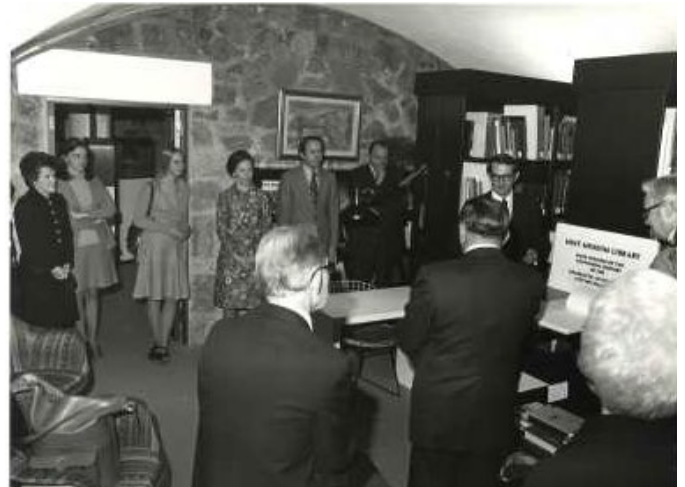
Figure 3: Library Dedication, The Mint Museum of Art, 1976, Courtesy of the Mint Museum Archives

SLA was a leap of faith for North Carolina librarians, as an earlier attempt to sustain a special libraries section of the North Carolina Library Association (NCLA) was unsuccessful. 22 Discussions at the 1955 NCLA biennial meeting resulted in a unanimous vote to disband the special libraries section in favor of a reduced committee because of a general lack of participation. 23