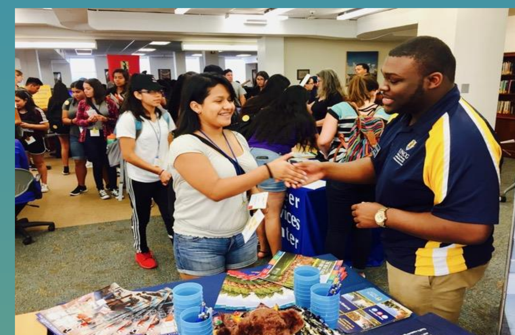
UNCG Admissions staff with students during college fair.