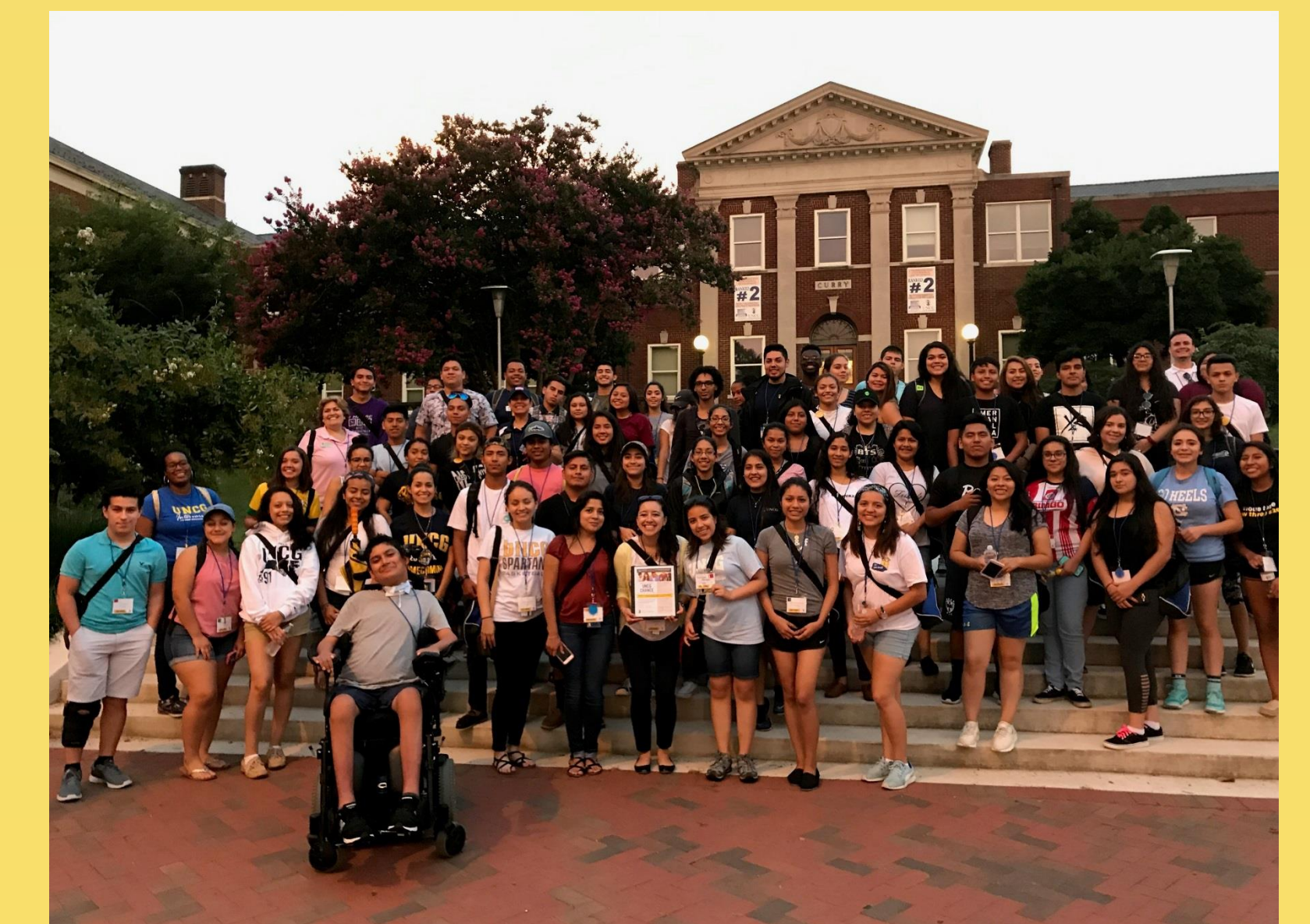
CHANCE students and University mentors posing for a group picture on campus.