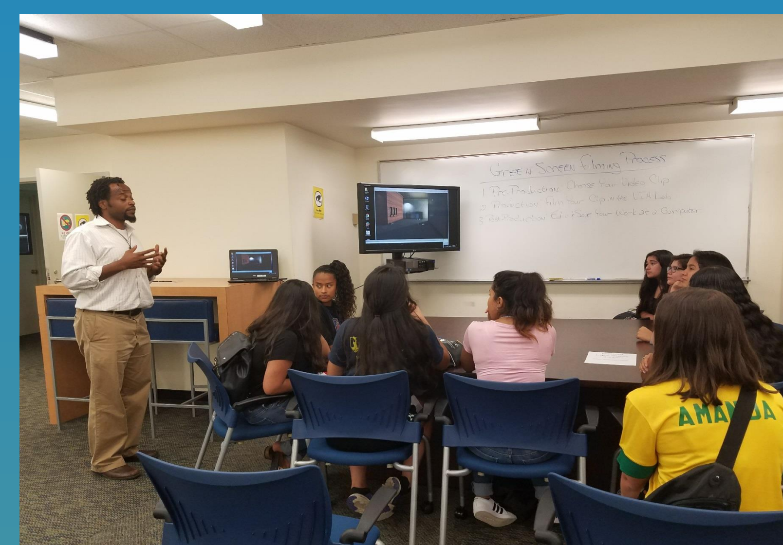
Students learning how to create video using green screen with VIA equipment in the DMC.