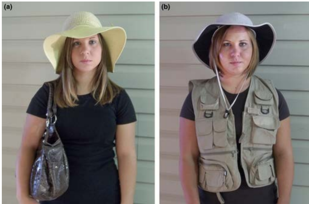
Figure 2. Stimulus image of (a) maternal figure and (b) zookeeper.