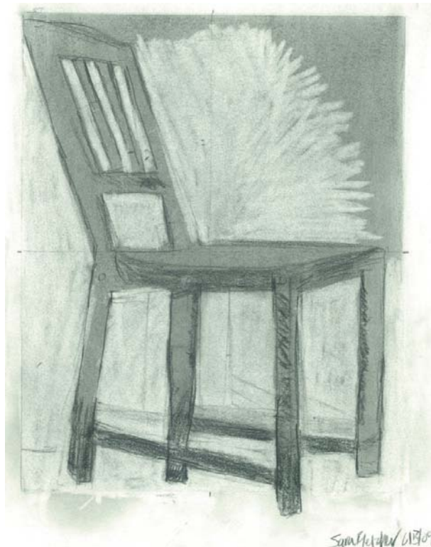
Figure 1. Perspective Drawing

revealed my biases about how certain objects should be drawn and for me the angles did not matter. However, the instructor questioned my way of approaching this task by asking me, from where I sat in the room, if all of the lines I saw were completely horizontal, in other words flat, or did some of them appear to be at an angle. I found myself wondering once again what this could mean, how were these objects which are composed of right angles and simple lines be so complex. I never considered that when drawing not everything that is visible is located on the same angle. In the end, these objects were definitely at an angle. What I came to understand through this engagement or dialogue was a revised meaning about the angles of lines in relation to the overall representation of a room (see Figure 1).