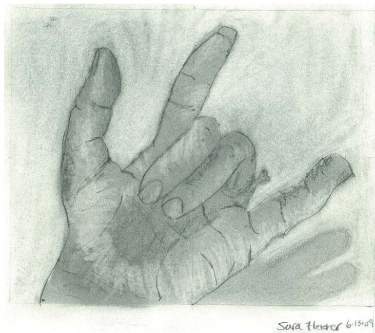
Figure 4. Drawing of My Hand

As an illustration, Figure 4 is a drawing of my hand. When I first began this assignment I assumed this would be one of the easier ones to complete because it was my hand and I had been with it for years. However, what I did not realize is that though I may have looked at my hands a thousand times, making it appear real on paper was not an easy task. Moreover, there was not a prescriptive way of making my hand look like it does in real life. I had to struggle to become fully engaged with the details, lines, wrinkles, shapes of the fingers, and everything that gives a hand its form in order to create the work of art. In other words, I had to interpret my hand based on the combination of what I saw and what I learned from the class instead of looking for a photocopy, an exact replica to be the end result.