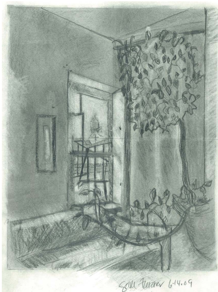
Figure 2. Vantage Point Drawing

unique in its own way; at the same time, there are those who claim that there people who are artists and those who are not. I think of drawing as a task that is not limited in terms of who can try it, meaning that one's gender or ethnic group is not excluded from trying to draw. These are all effects of my history. In essence, we all have histories that have an effect on our understanding of trust.