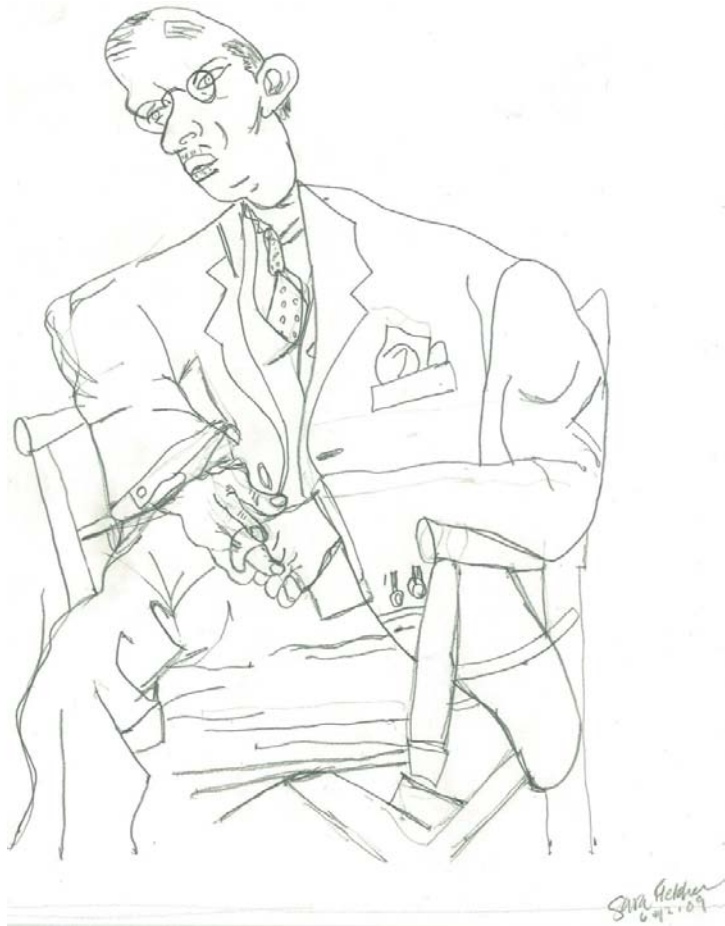
Figure 3. My Drawing of Picasso's Igor Stravinsky

virtual replica of his famous work, Igor Stravinsky ? This was exactly the task I was asked to do on the initial day of class. I could not believe my ears. This approach ran counter to everything I ever knew about drawing. Could this be too radical? How would I create anything even close to a Picasso? Was drawing something upside down something new age? In essence, this was a struggle for me to understand and thus another revealing moment which only served to further my understanding of drawing. Refer to Figure 3 to see what came of this experience. Though not perfect, needless to say, I was impressed with myself!