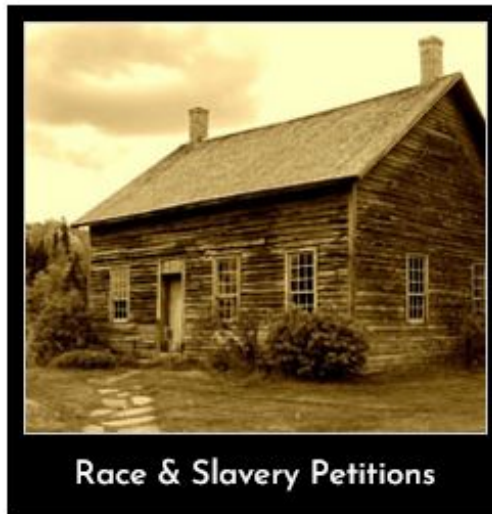
Race & Slavery Petitions