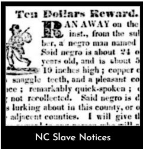
NC Slave Notices