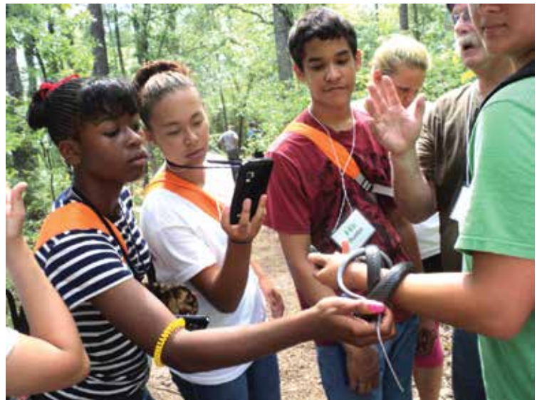
Students digitally document the capture of a snake. (Note: Safety glasses or goggles are recommended for woodland field activities.)