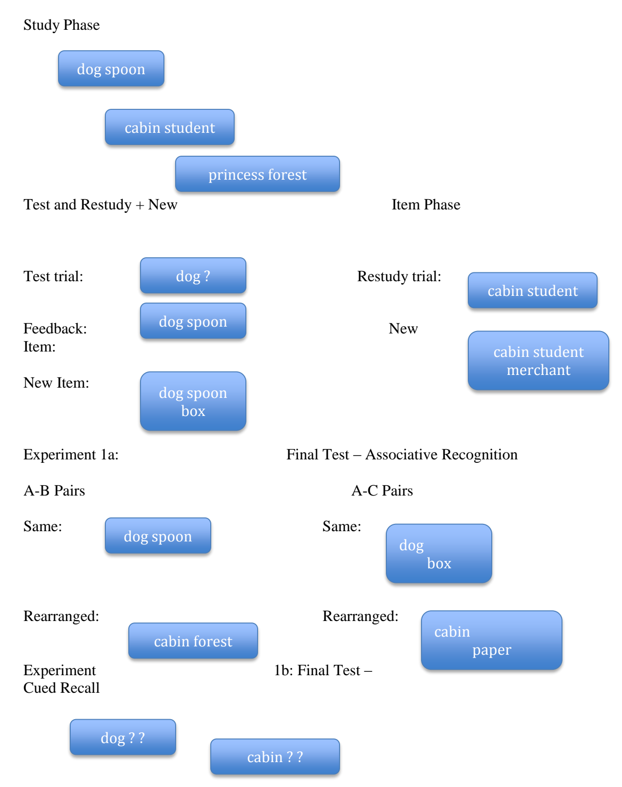
Figure 1. Paradigm of Experiments 1a and 1b.