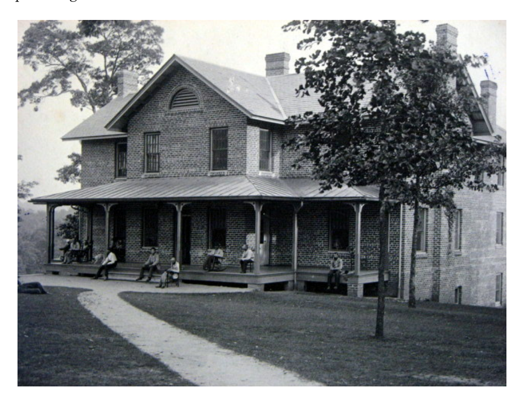
Figure 3: Patrick Murphy's 1906 pamphlet about Colony Treatment aimed to help the public understand the benefits of this treatment approach. The pamphlet included several photos of patients at colony buildings.

colony approach. "The colony plan," he wrote, "out on a farm in the fresh air, with plenty of light work, where these poor people may be properly treated and brought back, if possible to their right mind, ought to be [expanded] in the future, as saving costly buildings and producing more cures."<sup>92</sup>