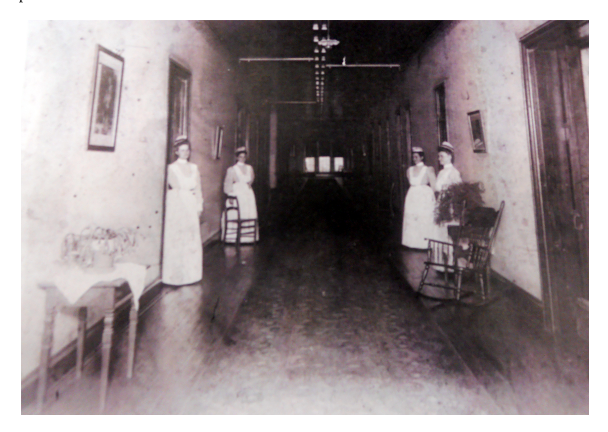
Figure 7: This photograph of a ward at the State Hospital at Morganton demonstrates the orderly home-like qualities that were praised by journalists and other asylum leaders.

was to the attendant that the superintendent committed the most crucial details of asylum practice."<sup>175</sup>