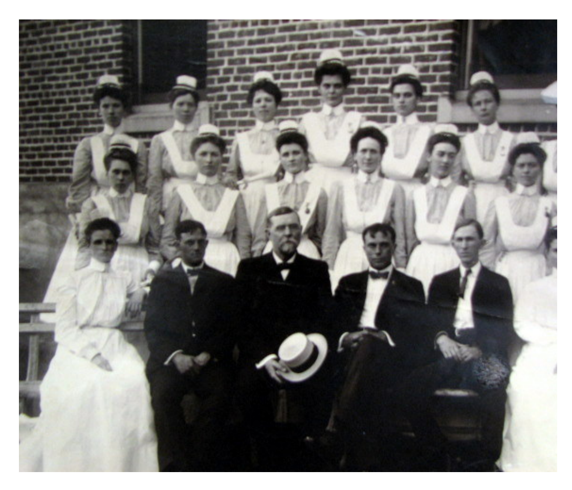
Figure 6: Publicizing nurse graduations became a common practice. This photo shows a graduating nurse class in the early 1900s.

operations, establishing nursing work as socially acceptable employment for young women in the rural South, and contributing to a favorable national image of the state's western asylum.