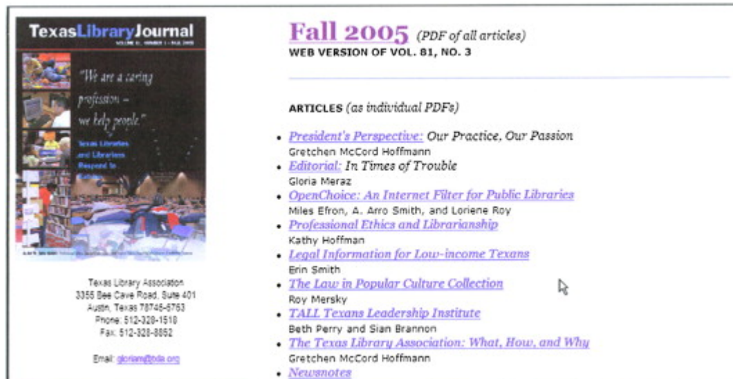
Figure 4. Texas Library Journal http://www.txla.org/pubs/tlj81/fall05.html .

But even with those membership concerns, she speculated that open access may not be far off: “Clearly, there is going to be a lot more electronic access whether we're ready or not. Everyone else is ready for it. The call for current access to our publications online will continue to knock on our door as it has for a while.”