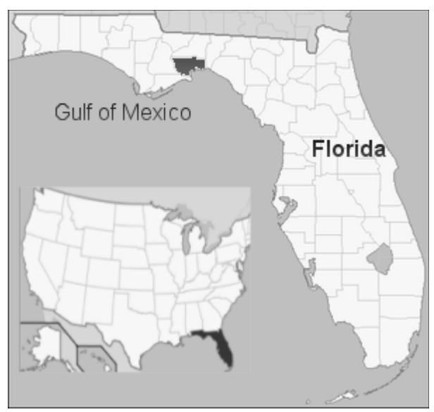
Figure 1. Site Location-Wakulla County, Florida

The area surrounding Wakulla Springs is well known for its karst topography, or landforms that have been modified by dissolution of soluble rock ( e.g. , limestone), resulting in a terrain that is characterized by natural springs, sinkholes, sinking and rising streams, and caves. Wakulla Spring itself is the park's centerpiece, and this particular spring is considered world class with regard to its flow and the size of the cave system that channels its flow. In 2007, after years of exploratory effort, divers connected a number of other systems in the WKP to Wakulla Spring. They entered at Turner Sink in the Leon Sinks Cave System and surfaced over 20 hours (a 6.5 hour dive with 14 hours of decompression due to 300 feet dive depths) later at Wakulla Spring after following almost 7 miles of cave passage. This established the Wakulla-Leon Sinks Cave System as the longest underwater cave in the U.S. (Kernagis, McKinlay, and Kincaid 2008). While Wakulla Spring is the most prominent feature in the park, it contains other springs as well, including Sally Ward and Emerald Spring that also have associated cave systems.