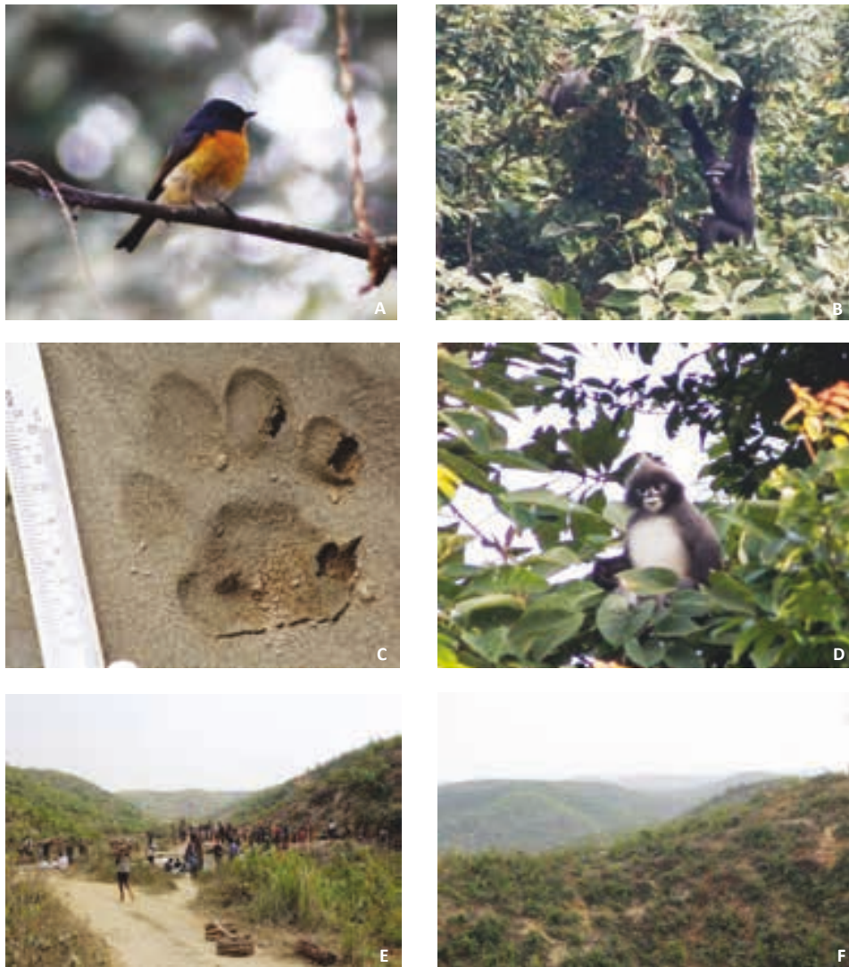
Image 2. A—Slaty-backed Flycatcher Ficedula erithacus from Inani, the first record of this species in Bangladesh | B—Western Hoolock Gibbon Hoolock hoolock at Inani | C—Pugmark of Indian Leopard Panthera pardus at Inani | D—Phayre's Leaf Monkey Trachypithecus phayrei at Inani | E—Fire wood collection from gibbon habitat in Ukhia | F—Loss of gibbon habitat at Ukhia.

Inani is highly degraded and fragmented without upper canopy trees, which is likely the main reason for their low reproductive output. We suggest that an extensive habitat restoration programme (Hossain et al. 2008) and the total protection of gibbon habitats at Inani are required to ensure the survival of the gibbons in this area.