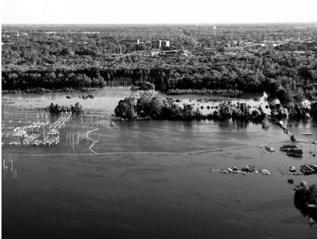
Fig. 1. Flooding along the Tar River in Greenville. View is towards the south with the power substation seen here on the left surrounded by booms. The Tar River channel is hidden behind the trees but downtown Greenville and the East Carolina University Campus dormitories can be seen on the far side of the river. (Source: Pitt County Management Information Systems).

The area chosen for this study included a section of the Tar River that passed through the City of Greenville in Pitt County, North Carolina (Fig. 2). This area was selected for evaluating the methods for modeling flood extent due to its proximity to Greenville, and because a digital aerial photograph documenting the flooding was available from the North Carolina Department of Emergency Management (NCDEM). The extent of flooding that occurred in this area was indicated on the composite photograph, which was taken two days after peak flood stage had been reached on 23 September 1999.